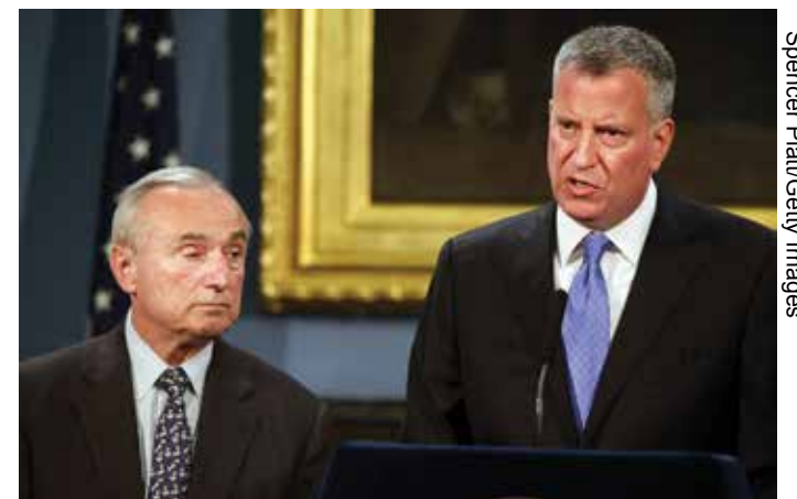
Internationalists at funeral of Eric Garner (left), July 23. Whether Bloomberg/Kelly or de Blasio/Bratton (above), racist cop terror doesn't stop.