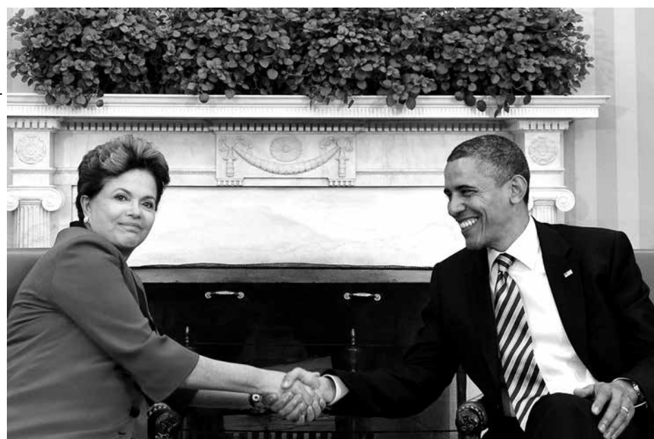
Brazilian president Dilma Rousseff with her imperialist overlord, Barack Obama in the White House, April 2012. Meanwhile, NSA was listening to phones of Rousseff and her top aides.