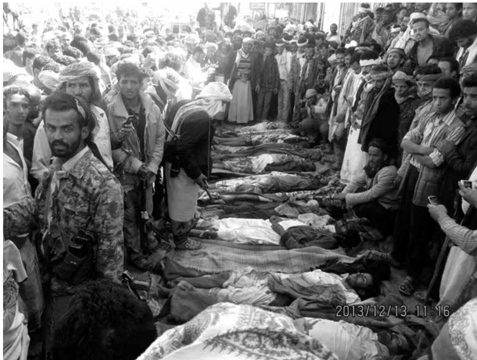
Victims of December 2013 U.S. drone strike in Bayda province, Yemen that killed 15 members of wedding party. U.S. has slaughtered thousands of civilians in “targeted killings” (assassinations) by drones.

We wage this struggle with our own methods, of militant class struggle. As at the time of the U.S. invasions of Afghanistan and