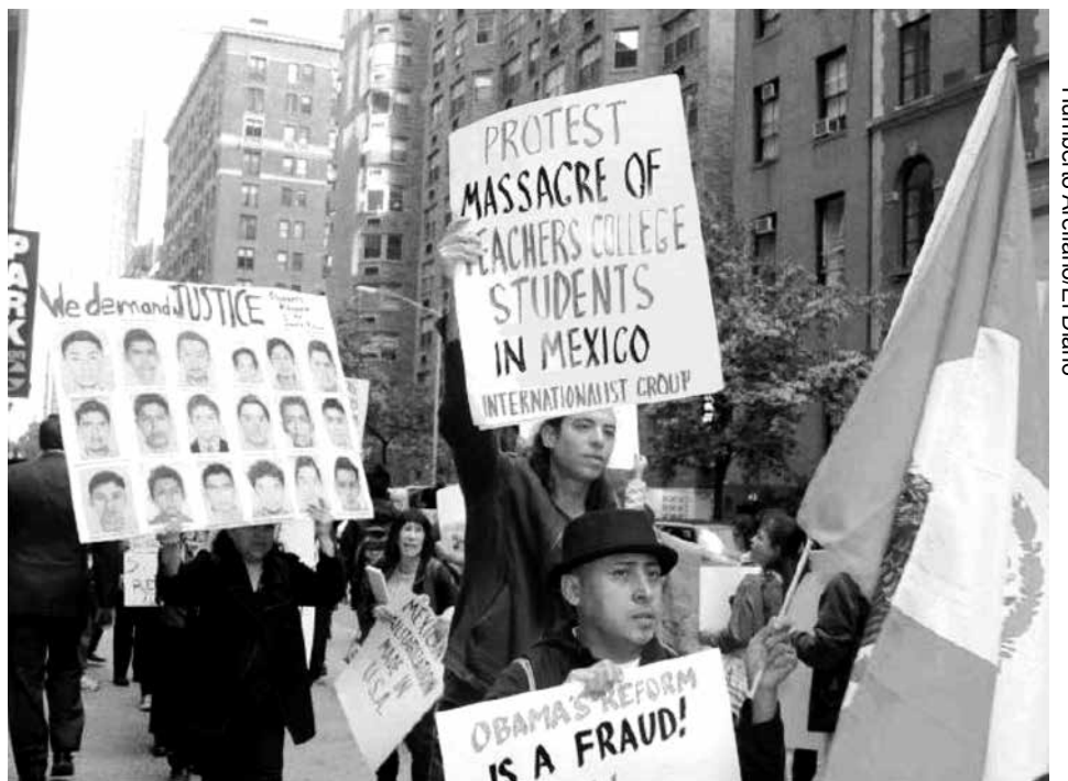
October 8 demonstration outside Mexican Consulate in New York City. Over 100 participated. At the end, the names of the murdered and disappeared students were read off and after each one the crowd responded, “¡presente!”

The rally at the end had 16 speakers including members of New York educa-