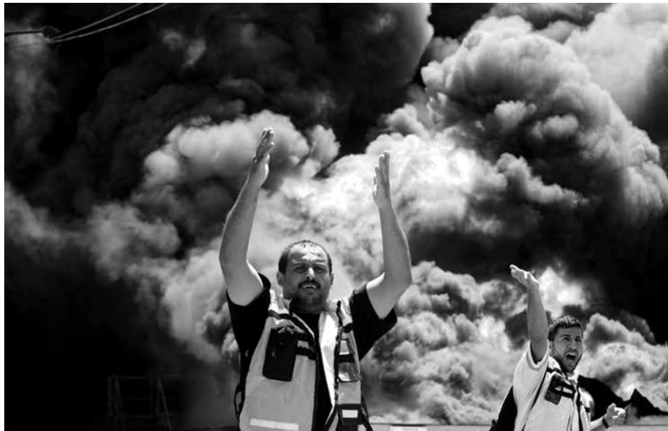
On July 29, Israel bombed Gaza’s only power plant, leaving the 1.8 million inhabitants without electricity, water or sewage treatment.

The Palestinian fighters on the ground have been resisting the Zionist assault bravely. The Gaza population has not buckled under the rain of bombs and pounding artillery. There have been solidarity demonstrations of thousands from New York to Tokyo; in France, tens of thousands defied a protest ban by the “socialist” government; 100,000 marched in London against Israel’s