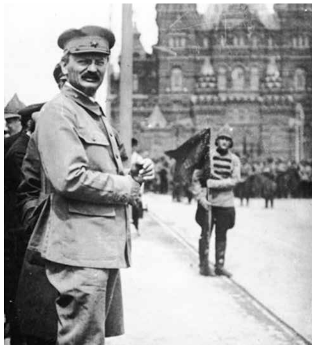
Leon Trotsky, founder of the Red Army, 1920.

Oriented to a somewhat more leftist milieu than the reformist PCF, with its nationalist praise of France as “the land of human rights,” the no less reformist New Anti-Capitalist Party (NPA) resorts to double-talk. Thus in