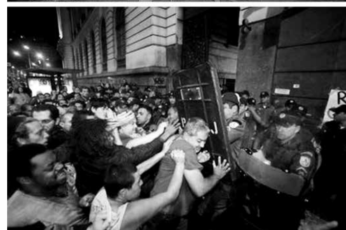
(Top) Defense squad of Rio de Janeiro teachers union SEPE during strike last year. (Bottom) Teachers clash with police when they were refused entry to Rio city council debate on teachers salary and seniority bill, 8 October 2013. Union leaders affiliated with PSTU and PSOL acted as firemen for the bosses, calling off the strike despite massive popular support.