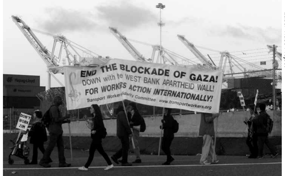
Cranes idle, booms up: Picket called by Transport Workers Solidarity Committee and others of Zim Lines ship in port of Oakland, California, September 27, to protest Israeli war and blockade of Gaza. ILWU longshoremen refused to work the ship in act of international labor solidarity.

In rejecting the characterization of Israel proper as a “colonial-settler state” or “apartheid state,” we in no way diminish the monstrous nature of the Zionist crimes. On the contrary, what Israeli rulers are prepared to do to the Palestinians is potentially much worse than the Rhodesian or South African racists. The murderous assault on Gaza currently underway could be the lead-up to “ethnic cleansing” on a massive scale – literally emptying Gaza of its population, whether by military means as in 1948 or by turning off the water, electricity and food supply. And if they get frustrated enough, or feel threatened enough, the Zionists (“hawks” and “doves” alike) are fully capable of carrying out a genocidal “final