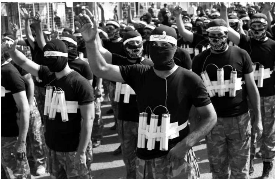
Mahdi Army rallies in its stronghold of Sadr City, Baghdad, on June 20. Shia militias have been terrorizing Sunni neighborhoods in the Iraqi capital.

army in June, the U.S. and its imperialist allies blamed then prime minister Nuri al-Maliki and his Shiite chauvinist government for excluding and persecuting Sunnis, which he did throughout his eight years in office, as Washington looked on.