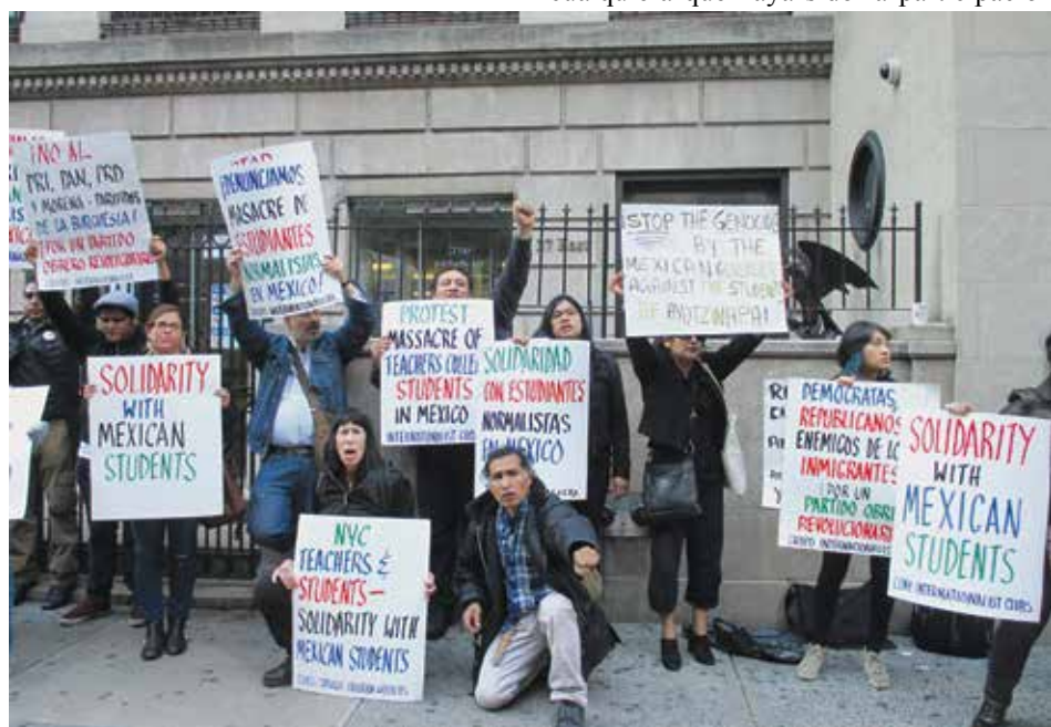
Protesta de emergencia por la matanza de Guerrero, iniciada por el Grupo Internacionalista frente al consulado mexicano en NY, el 5 de octubre.