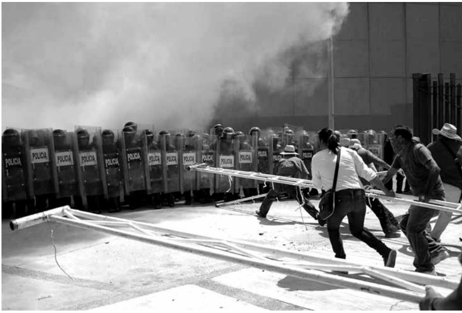
Outrage sweeps Mexico over massacre in Iguala. Militant teachers of the CETEG charge police lines (above left) outside offices of Guerrero state government in Chilpancingo, which were later torched (above right), October 13. In Mexico City, 25,000 protesters marched to the Zócalo on October 8 (below).