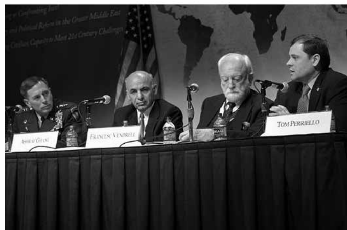
Climate March organizers Avaaz are major lobbyists for imperialist aggression. Above: Avaaz claims its e-mail blast played key role in getting U.N. approval for "no-fly zone" which led to destruction of Libya. Below: Avaaz/Purpose co-founder Tom Perriello (right) with ex-general David Petraeus (left) at U.S. Institute of Peace.