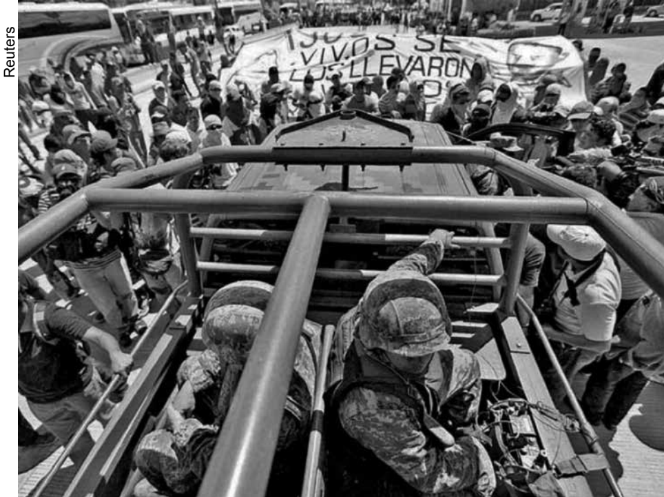
Students from the teachers college of Ayotzinapa blocked a caravan of troops on highway to Acapulco on October 5, finally forcing it to leave.

“It is not a question of one ruler. It is not