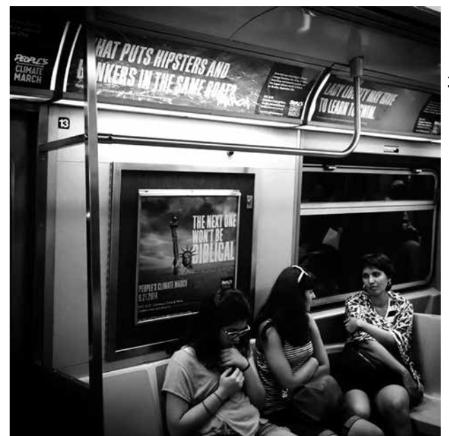
Subway ad for People's Climate March.

Avaaz/Purpose credits itself with having played a major role in getting the U.N.-authorized U.S.-NATO "no fly zone" over Libya in 2011 that gave the green light for the bloody imperialist attack that toppled the government of Muammar Qaddafi and destroyed the country. U.S. ambassador to the U.N. Susan Rice thanked Avaaz for its e-mail blitz of one million messages. Last year, Avaaz mounted a major campaign to push for U.S. bombing of Syria, using the lie of massive use of chemical weapons against civilians by the Assad regime. After last year's failure, Avaaz/Purpose lead-