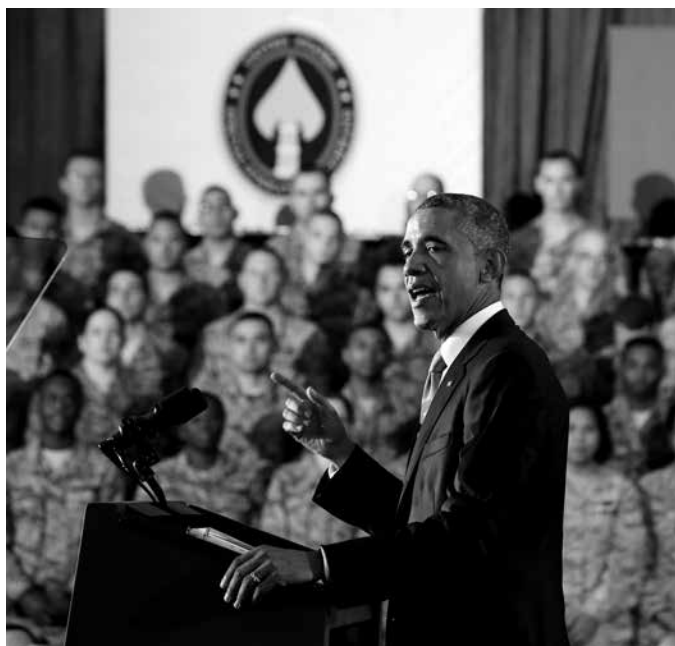
U.S. president Obama vows not to send ground troops to Iraq speaking at U.S. Central Command headquarters, McGill AFB, Tampa, FL, September 17. But Pentagon brass repeatedly contradict him.

Meanwhile, in Syria U.S. air strikes have not only hit I.S. targets in the east but also affiliates of the al-Nusra Front, the official Al Qaeda franchisee, from which the group now calling itself the Islamic State split earlier this year. A few days earlier, U.S. spy chiefs began talking about a hitherto unknown “Khorasan Group” linked to al-Nusra which was supposedly just as dangerous as the I.S. (While the U.S. considers al-Nusra a terrorist organization, the so-called “moderate” Syrian rebels work closely with it.) So when air strikes targeting the “Khorasan Group” led to civilian casu-