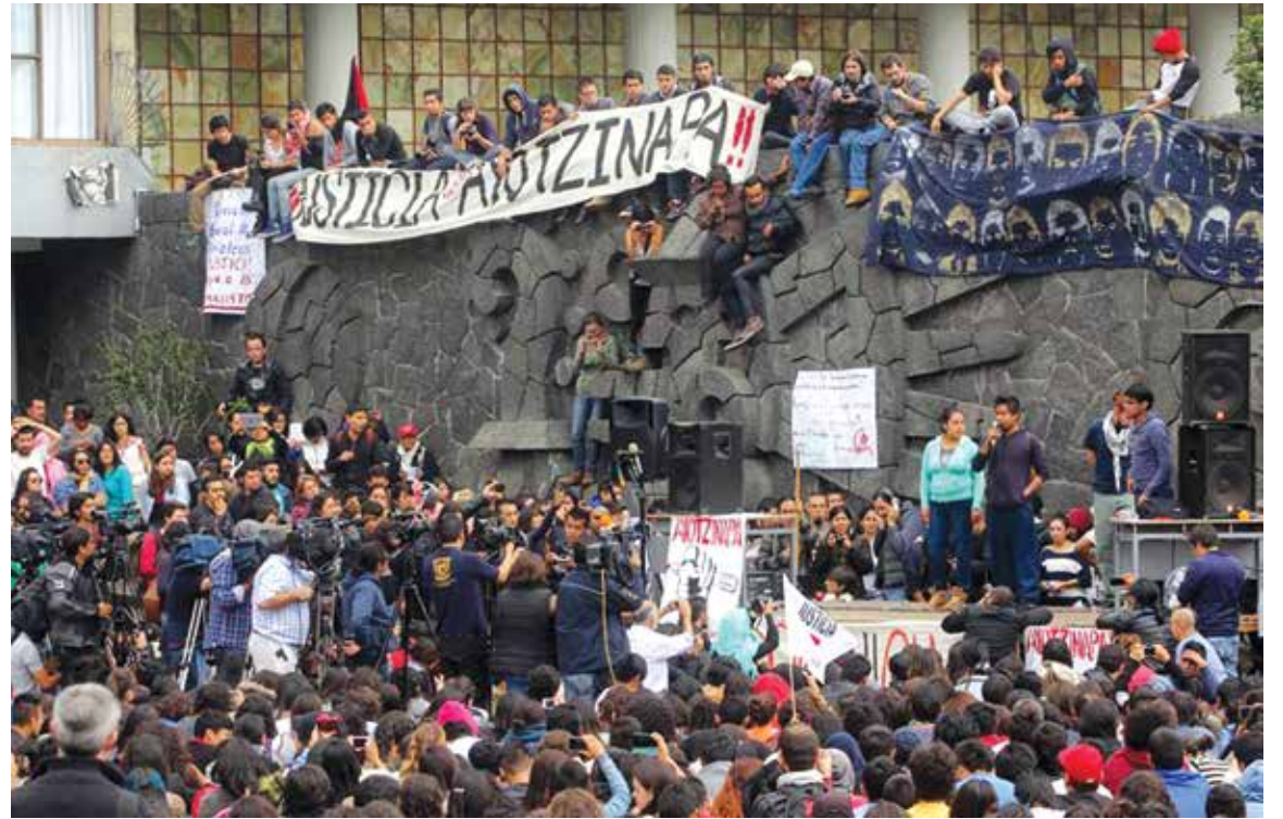
Mitin en Ciudad Universitaria durante el paro de la UNAM y otras universidades el 15 de octubre denunciando el asesinato y desaparición de normalistas de Ayotzinapa, Guerrero.