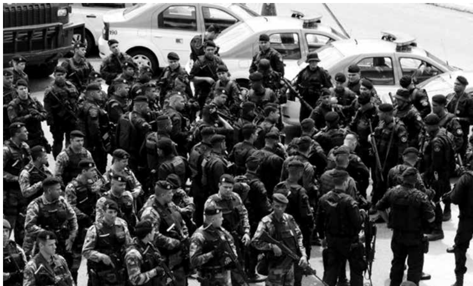
Militarized “democracy.” Special operation of the Shock Battalion (Batalhão de Choque) of the Military Police of Rio de Janeiro took the streets to oversee elections (and intimidate voters).

Cast a Blank Ballot and Forge a Revolutionary Workers Party!