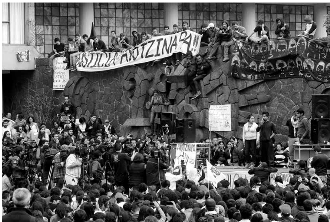
Students strike at National University of Mexico 15 in protest against massacre of students from Ayotzinapa teachers college. Poster of Grupo Internacionalista (on wall to left of speakers platform) calls for “National Strike Against the Government of Murder!”