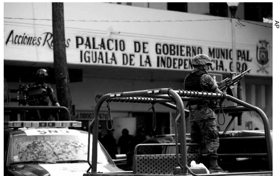
Mexican president Peña Nieto sent in National Gendarmerie (rear), a new unit of the National Police, to patrol Iguala together with army troops (foreground).