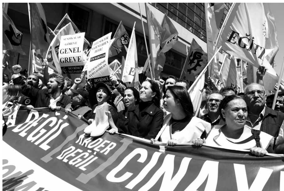
Demonstrators march in the Gayrettepe district of Istanbul during one-day general strike called by left-wing unions over mine disaster in Soma, 15 May 2014. Protesters chanted, “This was not an accident, this was murder” and called for Erdogan government to resign. Turkish labor should come to the aid of besieged Kurds in Kobanê by using their class power to bring down the labor-hating, warmongering Erdogan regime, fighting for workers revolution.

defeat imperialism, authentic Trotskyists have long defended the PKK, as well as defending Iranian and Iraqi Kurds against repression by the shah, Khomeini and Saddam Hussein. We call for a socialist republic of united Kurdistan, to overcome the national oppression of the 30+ million Kurds, the largest nation in the world without a state due to the 1916 Sykes-Picot treaty and 1923 Lausanne treaty that carved up the Ottoman Empire. While opposing nationalism, this is a program for internationalist class struggle against the rulers of Iran, Iraq, Syria, Turkey, all with oppressed Kurdish minorities; against the imperialists, and against the Kurdish bourgeois ruling clans.