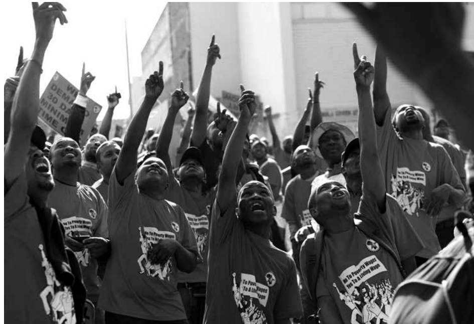
Members of the National Union of Metalworkers of South Africa (NUMSA) in Durban on July 1, first day of the national strike, point to non-striking construction workers demanding they join the walkout.

Then on July 1, the National Union of Metalworkers of South Africa (NUMSA) launched an indefinite strike involving more than 220,000 workers in the engineering and metals sector, ushered in by massive marches by its membership across the country. The strike hit producers of iron, steel, durable consumer goods and plastics. By July 4, General Motors had to shut down its Port Elizabeth auto assembly plant due to parts