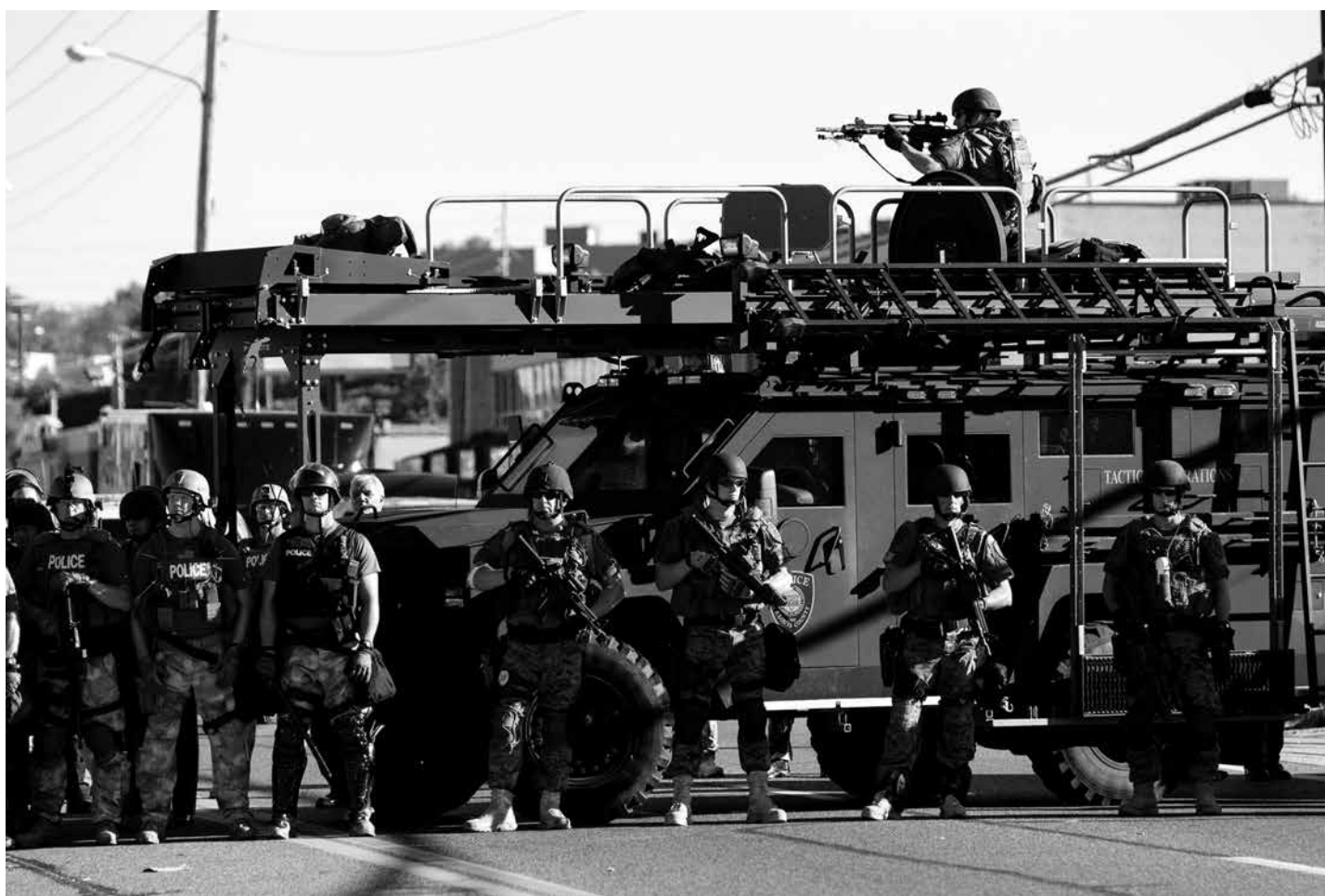
August 13: St. Louis County police confront demonstrators in Ferguson, Missouri with armored vehicle, body armor, assault rifles and a sniper aiming at the crowd. Equipment supplied by federal government under the guise of fighting “terrorism.” The terrorists are the police.