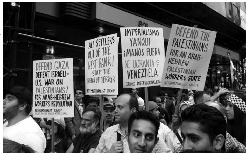
Internationalist Group at July 9 protest in NYC against Israeli war on Gaza.

In reality, the reference to the kidnapping/murder of the Jewish teenagers (and to the relatively few rocket attacks) was only a pretext for carrying out a military operation against the Gaza military tunnels that had