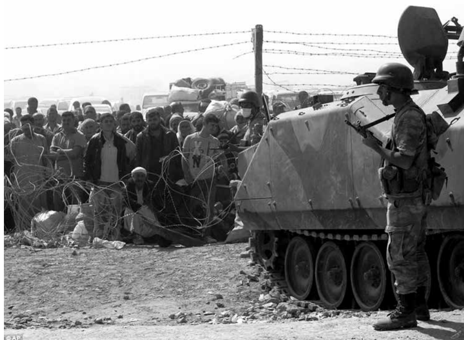
Turkish soldiers and tanks at Syrian border keep out refugees fleeing Islamic State attack on Kobanê in September. Turkey’s Islamist government has aided Islamic State jihadis as it seeks to restore “glory” of Ottoman empire.