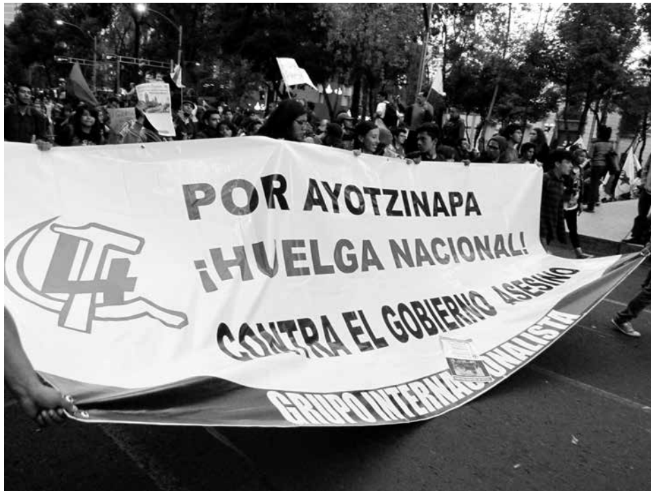
El Grupo Internacionalista en la marcha del 22 de octubre en la Cd. de México denunciando la matanza de estudiantes normalistas de Ayotzinapa.

"Hemos planteado muchas veces a las autoridades que si se cierran algunas de las normales rurales va a haber mucho alboroto de los jóvenes. No se olviden que las normales rurales han sido semilleros de guerrilleros, pero si no hacemos esto, van a seguir con lo mismo".