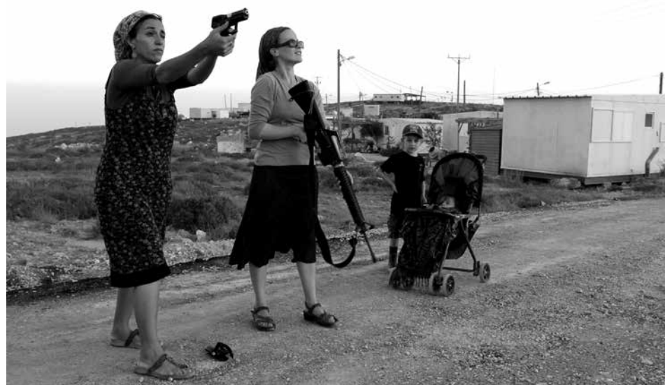
Women settlers practice firing in Jewish settlement of Pnei Kedem, near Bethlehem, in September 2012. All settlements are strategic bases to control and expel Palestinian Arabs. All settlers out of the West Bank!