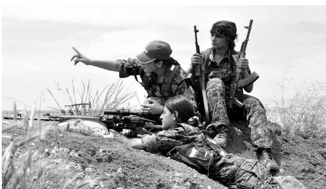
Women fighters of the YPJ training. Thousands of Kurdish women in militias will have significant impact, while liberation from traditional oppression will require a social revolution.

According to Graeber, a veritable “social revolution” is underway, led by the Kurdish Workers Party (PKK) and its Syrian affiliate, the PYD. The PKK, whose leader Abdullah Öcalan languishes in a Turkish jail, is still labeled terrorist by Turkey and U.S., the European Union and NATO imperialists for fighting for Kurdish independence. But “the PKK itself is no longer anything remotely like the old top-down Leninist party it once was” and doesn’t even call for a Kurdish state, says Graeber. Instead, it is now inspired by the Mexican Zapatistas and the anarchist Murray Bookchin, adopting the vision of “libertarian municipalism” to create “self-governing communities” based on “direct democracy” which could become a “model