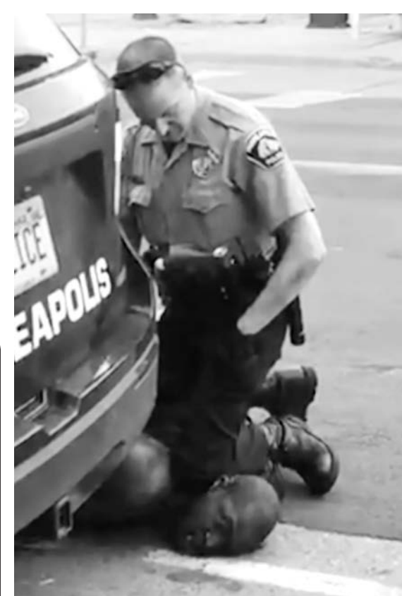
Minneapolis cop knees George Floyd, killing him, 25 May 2020.

stop to racist police terror because they depend on the guard dogs of capital to maintain 'law and order.' Some of these politicians feign support to protests like Black Lives Matter in order to make sure they don't get 'out of control' (i.e., threaten the domination of United Healthcare, Target, Best Buy, 3M, U.S. Bancorp, General Mills and other giant corporations). And if protesters can't be assuaged by 'I feel your