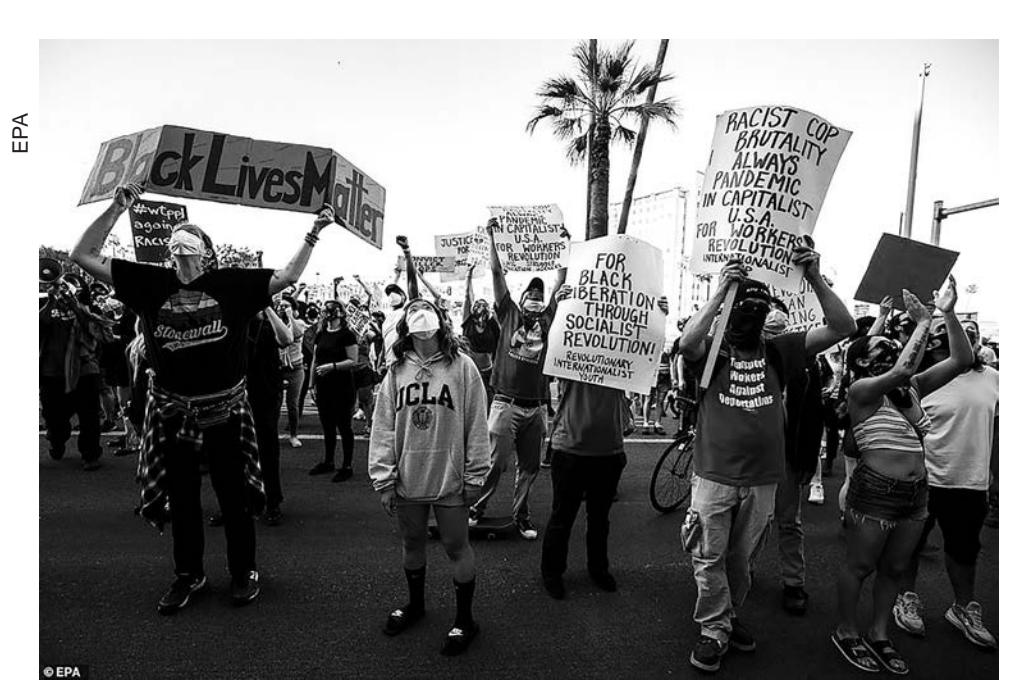
Internationalists at May 27 Los Angeles protest over murder of Floyd George by Minneapolis police.

pain' bromides, the liberals call in the cops."