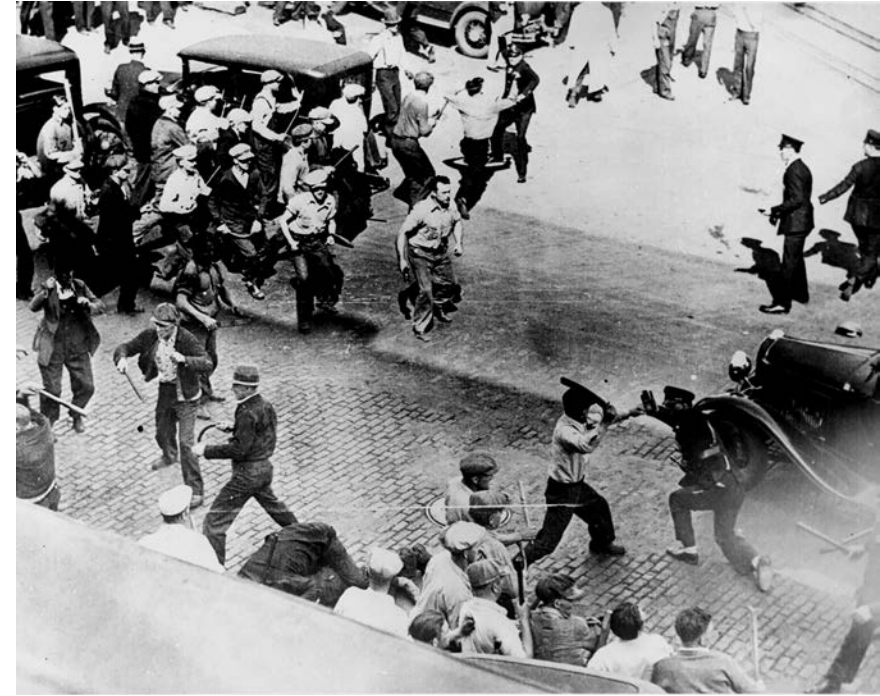
"Battle of Deputies Run," 21 May 1934. Hundreds of striking Teamsters ran off 1,500 police, special deputies and scabs.

"Driving while black," "jogging while black," "sleeping at home while black." Floyd is just the latest addition to the