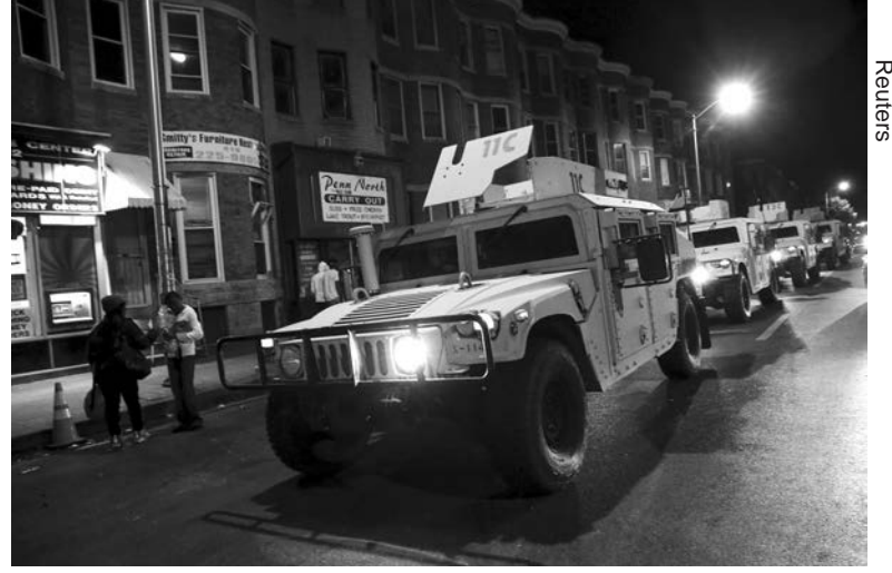
National Guard locks down black Baltimore in April 2015 after police murder of Freddie Gray. Cops and National Guard, out!

The fundamental job of the cops is to maintain brutal social control over the urban ghetto. They are supported in this purpose by the myth of "broken windows policing." According to this "theory" cops are charged with enforcing "quality of life crimes" such as "loitering," public drinking and begging. This was the original rationale for the racist "stop and frisk" policies of the New York Police Department. It was certainly the motivation in the NYPD's strangling to death of Eric Garner in Staten Island. Garner was on the street selling