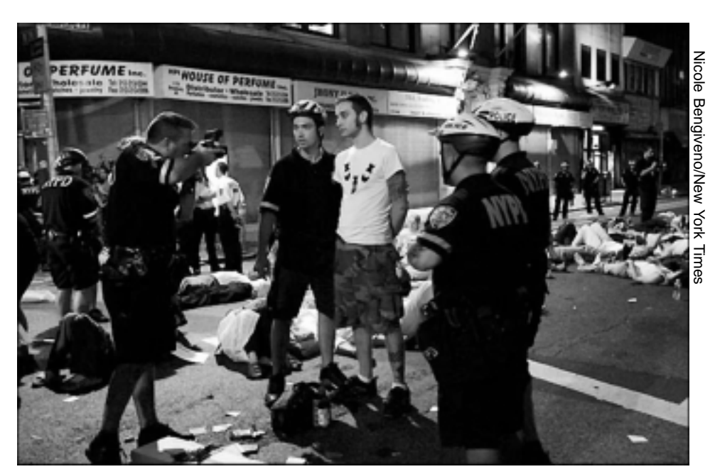
Dress rehearsal for internal war: NYC rulers screamed about "anarchist threat" as they prepared to carry out mass arrests of more than 1,800 protesters on the flimsiest of trumped-up charges. Drop all charges against RNC protesters!

The starting point for Marxists is the struggle to organize the vast majority of the