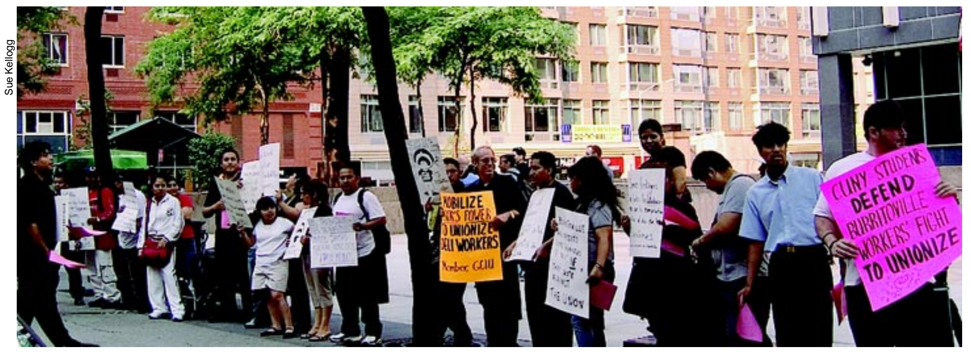
Trabajadores de los restaurantes Burritoville frente al Edificio Federal en Nueva York, el 30 de junio. "Departamento Laboral, ¡instrumento patronal!" gritaron.