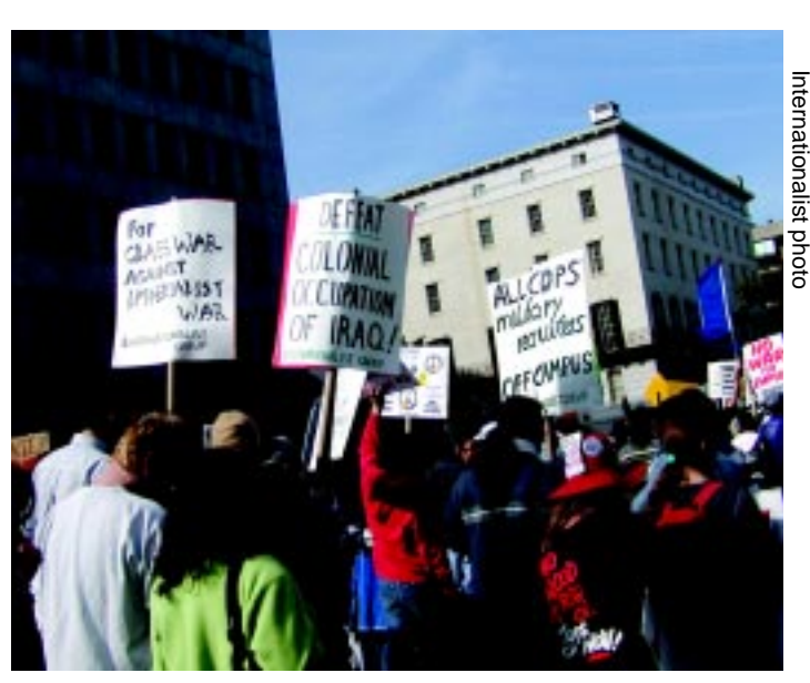
The Revolutionary Reconstruction Club and IG are campaigning to drive military recruiters off campus.

In the fall of 2003, at Bronx Community College the Revolutionary Reconstruction Club received heightened support from students for our efforts to drive military and police recruiters off campus, after an inci-