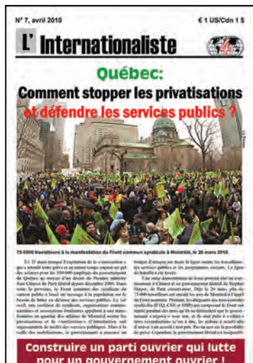
L'Internationaliste, organ of the League for the Fourth International