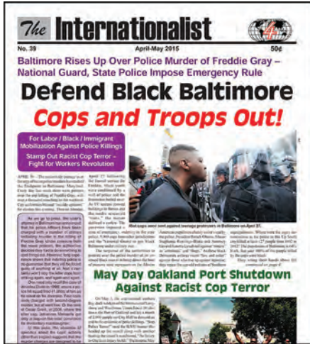
The Internationalist, newspaper of the Internationalist Group/U.S.