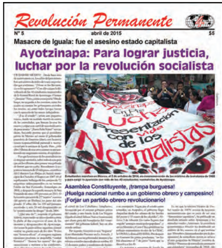
Revolución Permanente, newspaper of the Grupo Internacionalista/México