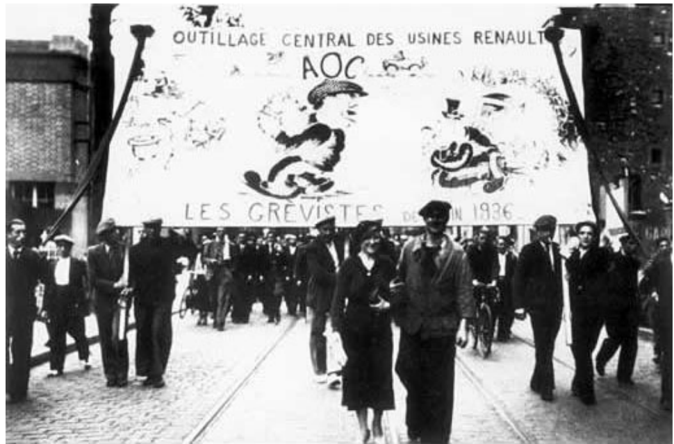
French unionists from the Renault Billancourt plant in Paris during the June 1936 general strike. Workers raised the red flag over the plant. The first task of the Popular Front Blum government was to end the strike.

This was the high point of the popular front, for it was in breaking the 1936 general strike that the Blum government accomplished the basic task set for it by the bourgeoisie – stopping the drift toward revolution. The few significant social reforms, such as the 40-hour week, were soon reversed. In 1937, after a year in of-