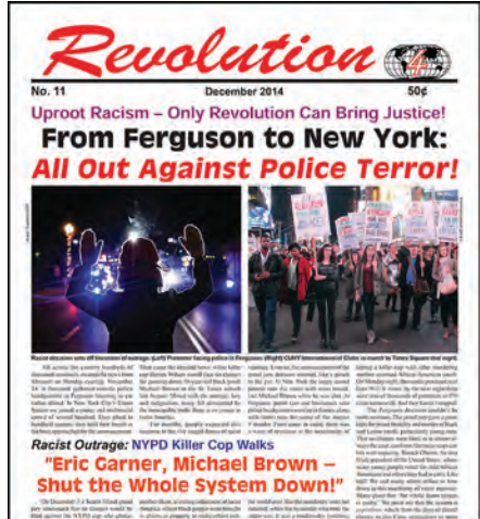
Revolution, newspaper of the CUNY Internationalist Clubs

Order from/make checks payable to: Mundial Publications, Box 3321, Church Street Station, New York, New York 10008, U.S.A.