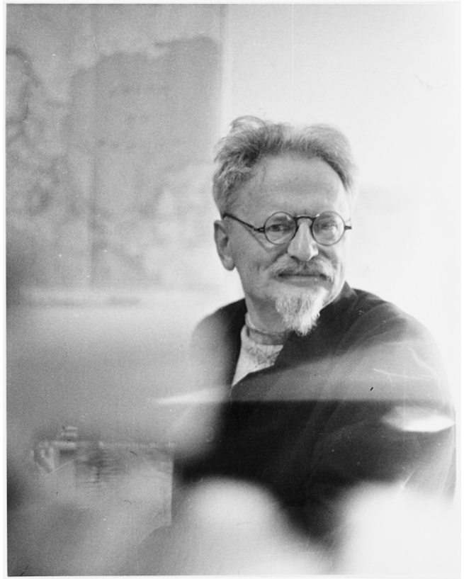
Leon Trotsky, in Coyoacán, Mexico (1940)

The Fourth International has already arisen out of great events: the greatest defeats of the proletariat in history. The cause for these defeats is to be found in the degeneration and perfidy of the old leadership. The class struggle does not tolerate an interruption. The Third In-