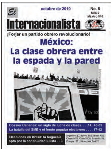
El Internacionalista, organ of the League for the Fourth International