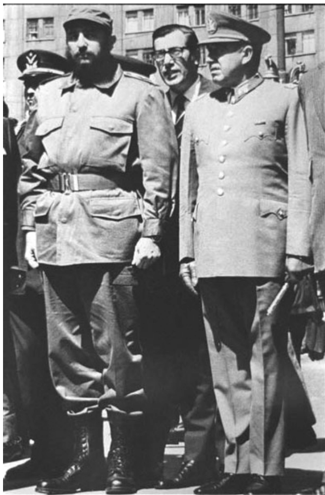
Fidel Castro reviews Chilean troops together with supposed “constitutionalist” official, General Pinochet, who ten months later carried out his bloody coup.

Although the reformists have constantly attempted to portray Chile as the most radical popular-front government in history (compared to Spain 1936-39, France 1933-36 or Chile at different times from 1936 to 1948), the myth is far from reality. Thus in Spain