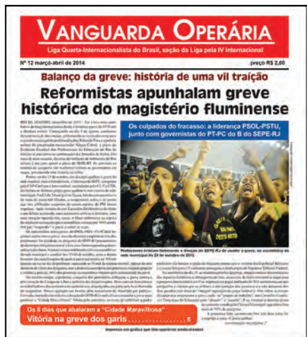
Vanguarda Operária, newspaper of the Liga Quarta-Internacionalista do Brasil