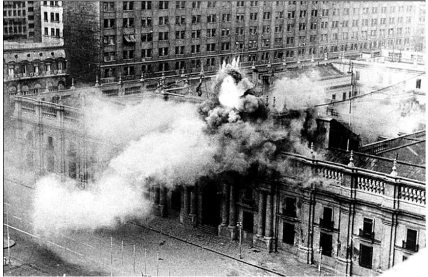
La Moneda, Chile’s presidential palace, being bombarded by air force jets during 11 September 1973 coup d’état.

“The government of the Unidad Popular is not a workers government. It is a coalition of workers and capitalist parties. The presence of the ‘radical’ bourgeoisie and the ‘democratic’ generals is a guarantee that the Allende government will not step beyond the bounds of capitalism. Their presence is a guarantee that the workers and peasants will be left disarmed and atomized in the face of the impending rightist coup. Rather than pressuring Allende ... we must instead call on the workers to break sharply with the bourgeois popular front and the government parties, to fight for a workers and peasants government based on a revo-