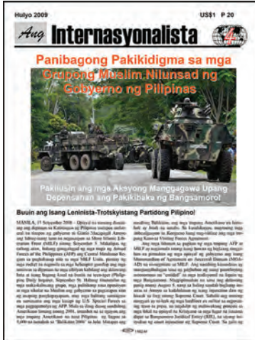
Ang Internasyonalista, publication in Tagalog of the LFI