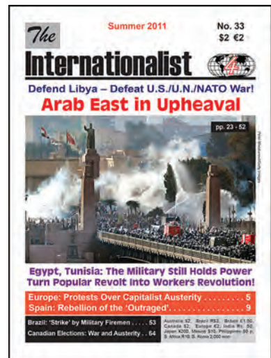
The Internationalist, magazine of the Internationalist Group/U.S.