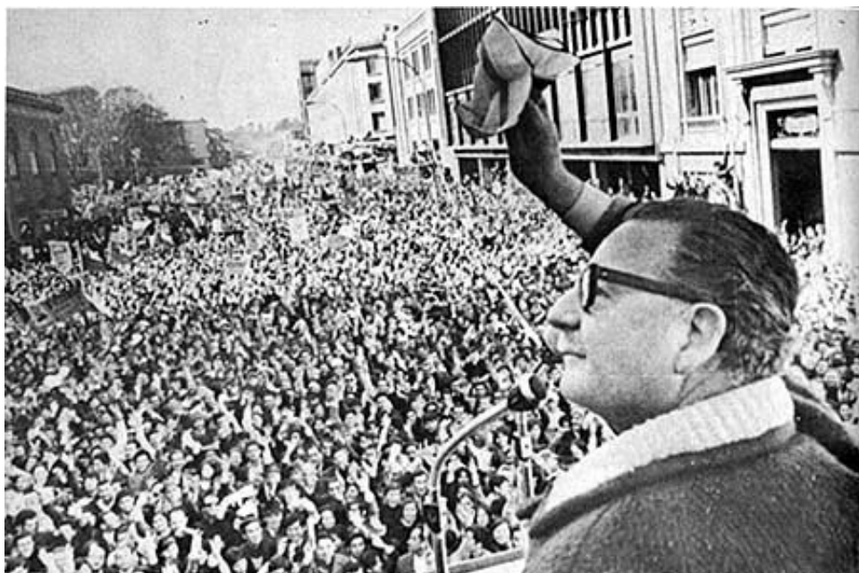
Salvador Allende greeting crowd after election victory in September 1970.

It is the most elementary duty for revolutionary Marxists to irreconcilably oppose the Popular Front