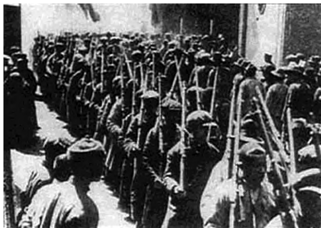
Fatal results of Stalin's criminal subordination of Chinese Communist Party to "anti-imperialist" Chiang Kai-shek's Guomindang. Top: 1925 Hong Kong-Canton general strike. Above: Shanghai workers march after 1927 insurrection. Stalin ordered CP to turn in arms. Below: Chiang's "pacification commission" beheads Communist workers.