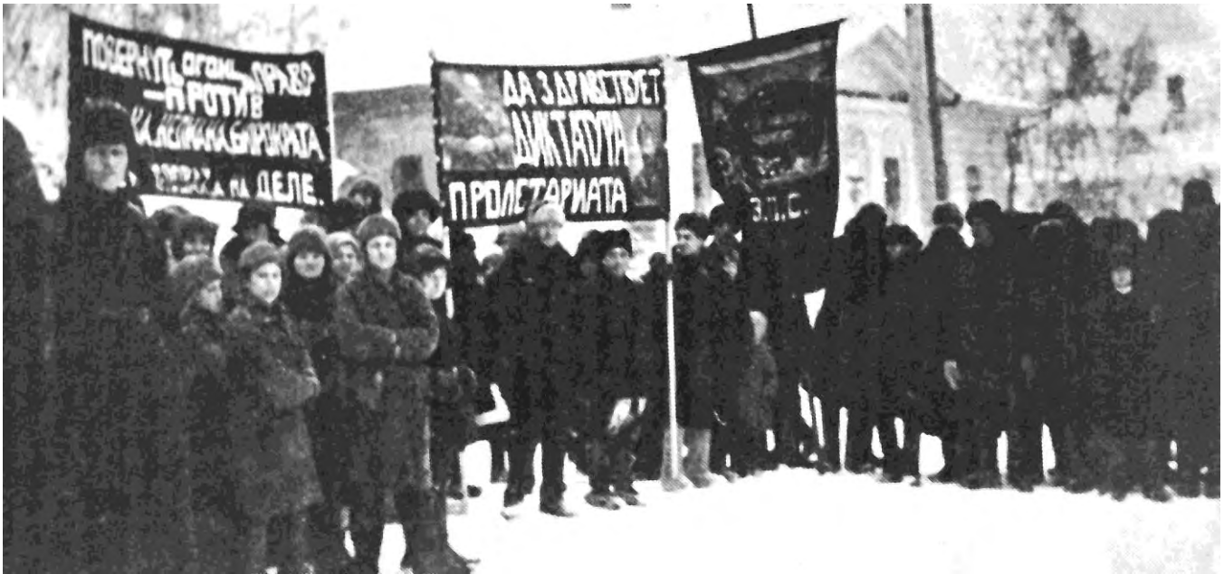
Left Oppositionists in exile colony at Yeniseisk, Siberia, demonstrate on the anniversary of the October Revolution in 1928. Center banner, with portraits of Lenin and Trotsky, says “Long Live the Dictatorship of the Proletariat.”

sion of systematic social reforms and the raising of the masses’ living standards ... every serious demand of the proletariat ... inevitably reaches beyond the limits of capitalist property relations and of the bourgeois state.” The task of the communist vanguard was to make the proletariat conscious of its tasks, through a series of transitional demands which formulate the objective needs of the working class in such a way as to make clear the need to destroy capitalism: