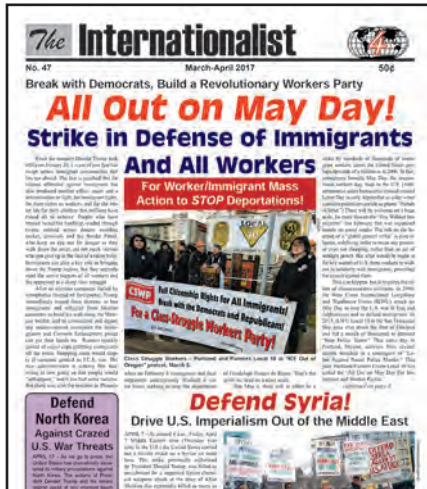
The Internationalist, newspaper of the Internationalist Group/U.S.