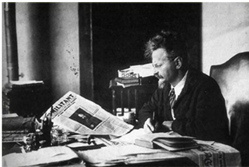
Leon Trotsky reading the newspaper of the U.S. Trotskyists.

The sectarian-defeatist "Third-Period" policies of the Comintern which led to the victory of fascism in Germany in 1933 forced the Left Opposition to adopt a radical change in its perspective. Ever since 1930, Trotsky had warned that the fate of the international revolutionary movement depended on the outcome of the struggle against the fascist threat in Germany. The Communists (KPD), following Stalin's orders, played directly into the hands of the fascists by refusing to call for a united front with the Social Democracy (SPD) against the Nazis, instead denouncing the SPD as "social-fascist."