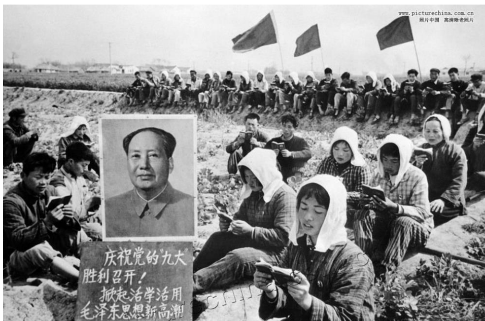
Peasants reading Mao's Little Red Book, 1965. The Great Anti-Proletarian, Anti-Cultural "Revolution" was a power struggle between two wings of the Stalinist bureaucracy, both hostile to the worker and peasant masses and neither opposed to allying with imperialism.

and the atomized, conservative party apparatus. In the main, the students and workers were organized and cynically manipulated by the bureaucratic groupings. Revolutionary Marxists could not support either the utopian-militarist nationalism of the Mao faction or the various careerists struggling to keep their jobs.