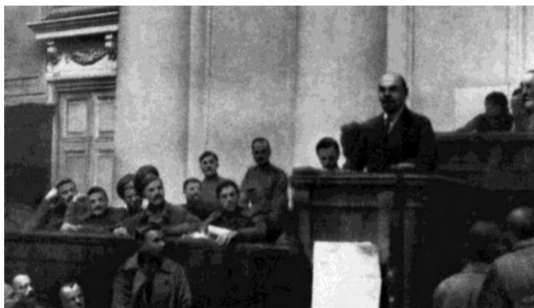
Lenin presents his “April Theses” in 1917 at the Tauride Palace, arguing for all power to the soviets. Bolshevik “Old Guard” including Stalin called for critical support to bourgeois Provisional Government.

It is true that Lenin both at this time and later occasionally referred to the soviets in the period February-October 1917 as an expression of the “revolutionary-democratic dictatorship of the proletariat and the peasantry,” but those soviets did not hold state power. The struggle for “All Power to the Soviets” was, as Lenin put it, the struggle against the petty bourgeoisie, which did not wish to struggle against capitalism. And the state which resulted from the October Revolution was the dictatorship of the working class, supported by the peasantry. From 1917 on Lenin never implied that there could be such a creature as a state of two classes, such as envisioned by Stalin and Mao. As he put it in his polemic against Kautsky, “The Soviets are the Russian form of the proletarian dictatorship” ( The Proletarian Revolution and the Renegade Kautsky [1918]).