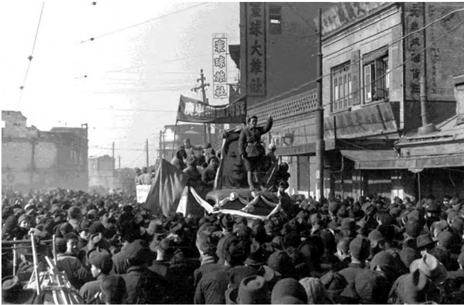
Mao's peasant-based People's Liberation Army entering Tianjin in 1949. In 1932, Trotsky warned that "when the peasant troops occupy the industrial centers and are brought face to face with the workers," the Stalinists may "counterpose the peasant army to the 'counter-revolutionary Trotskyists' in a hostile manner." Precisely this occurred when the victorious PLA took China's cities in 1949 and proceeded to round up the Chinese Trotskyists.

ship of the proletariat and the peasantry," which Lenin explicitly abandoned in April 1917 (see part 1 of this series), was completely inappropriate to China: