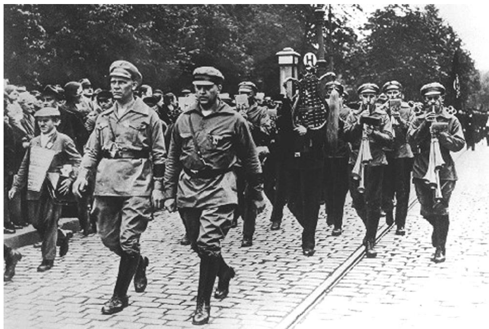
German CP leader Ernst Thälmann (left) at the head of the Rotfront-Kämpferbund (red front militia) in 1927. Thälmann rejected Trotsky’s call for a united working-class front against fascists as “counterrevolutionary” and announced in September 1932 that “Germany will of course not go fascist.” Nine months later he was in a Nazi jail.

Here was a situation that cried out for the policy of the united front. The leaders did not want to fight but to retreat. The rank and file, however, could not retreat — they had to fight or face annihilation. Call on the social-democratic leadership to mount a united offensive against the Nazis! If they accept, the fascist menace could be destroyed and the road opened to revolution. If they refuse, their treachery is clearly exposed