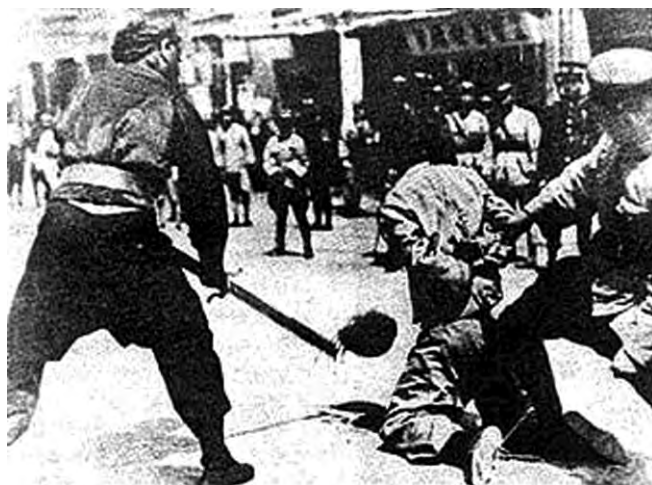
"The official subordination of the Communist Party to the bourgeois leadership, and the official prohibition of forming soviets (Stalin and Bukharin taught that the Guomindang 'took the place of