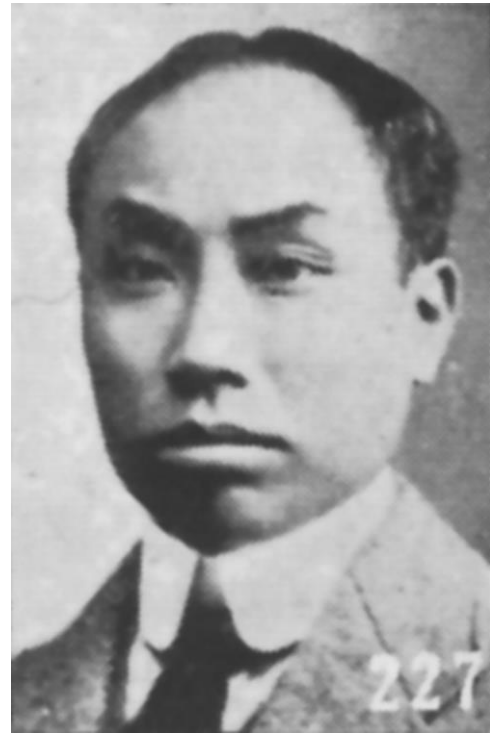
Chen Duxiu, founder of the Communist Party, was scapegoated and expelled from CP after 1927 massacre for carrying out Stalin’s orders (which he had opposed) to support Chiang Kai-shek. He subsequently joined the Trotskyist Left Opposition.

“It [the ‘people’s republic’] is willing to have the broad petty-bourgeois class unite with the masses in its territory. All petty-bourgeois revolutionary class elements will be given the right to vote and be elected in the soviet.”