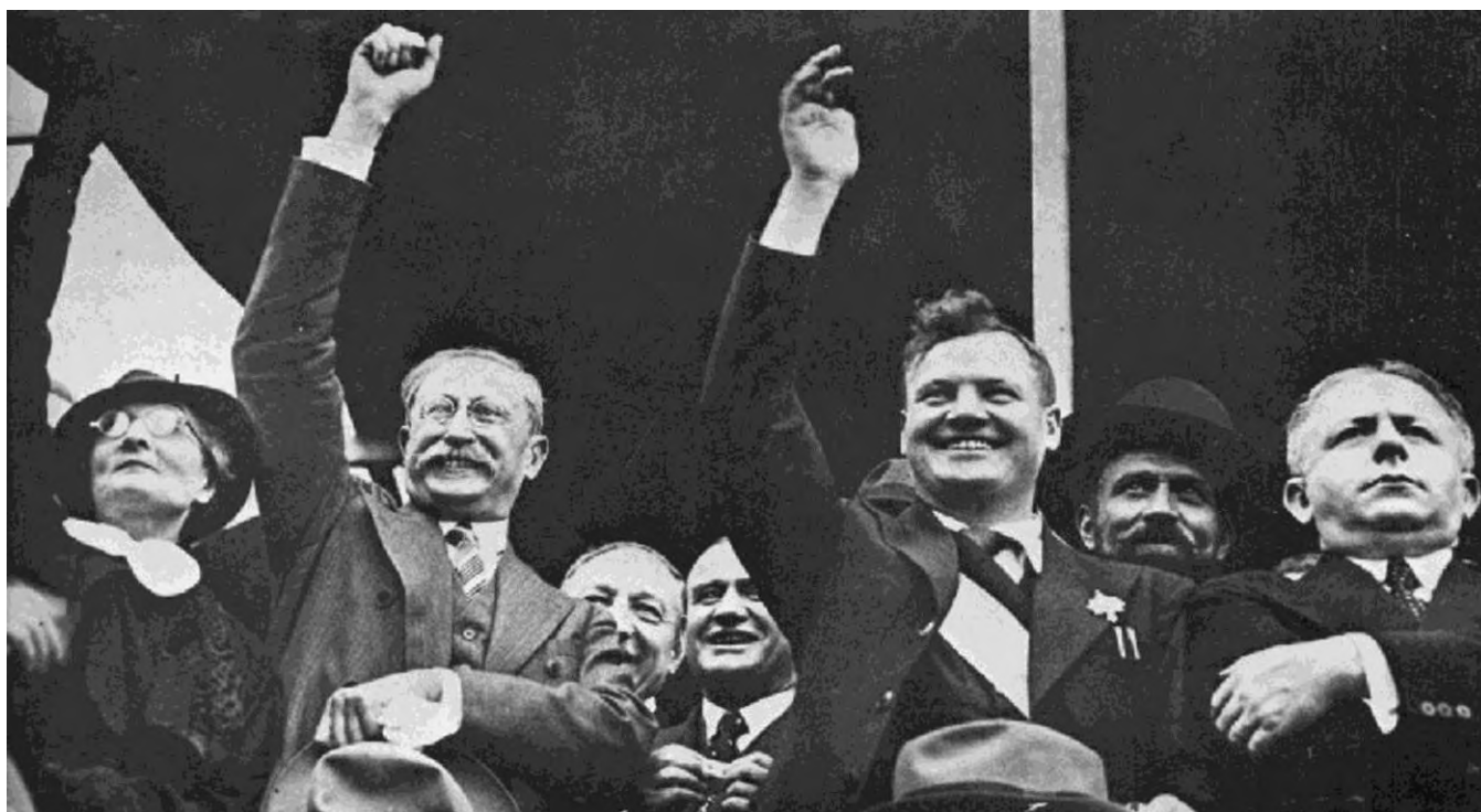
French Socialist premier Léon Blum (left), Communist Party leader Maurice Thorez (center) and bourgeois Radical Edouard Daladier (in second row center) celebrate the June 1936 electoral victory of the Popular Front. Far from blocking the fascists, the popular front was a roadblock to revolution, repressing the workers and opening the way to victory of right-wing Bonapartist forces (Pétain in France, Franco in Spain).

The turn toward the “Popular Front” came toward the end of 1933 as the Stalinized Communist International made a quick about-face from its ultra-left “Third Period” policies. With the triumph of Hitler and the renewed threat of imperialist attack the panic-stricken Soviet bureaucracy set about lining up allies for defense of the Soviet fatherland. Russia entered the League of Nations and signed a Franco-Soviet military assistance pact. Throughout this period the Comintern sought to ingratiate itself with the bourgeoisies of the democratic imperialist powers through calculated containment of revolutionary proletarian movements in Europe. The method: class-collaborationist alliances with and participation in the governments of the bourgeoisie. The cover: the struggle against fascism.