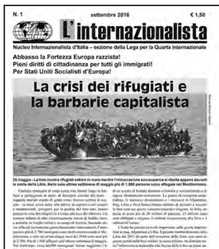
L'Internazionale, newspaper of the Nucleo Internazionalista d'Italia