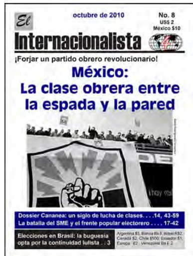
El Internacionalista, organ of the League for the Fourth International