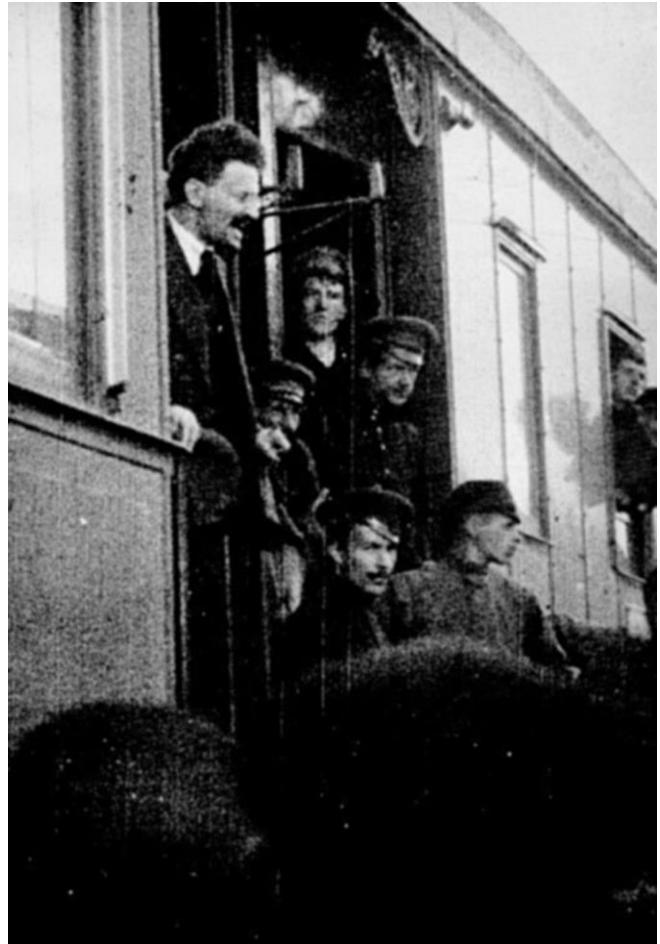
Leon Trotsky arriving in Petrograd, May 1917.

At the heart of this conflict is the Trotskyist theory of permanent revolution. This theory, first advanced at the time of the 1905 Russian revolution, was summarized by Trotsky in his article "Three Concepts of the