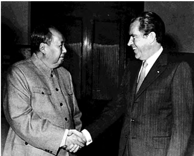
Stalinist treachery: Mao Zedong meets with Richard Nixon in Beijing, February 1972, to form a de facto alliance with U.S. imperialism against the Soviet Union even as U.S. B-52s are carpet-bombing North Vietnam.

solite nuclear superiority, the Soviet army would have an advantage in conventional war not offset by China's greater manpower reserves. The Russian side of the border is much more heavily populated. And the Turkic-speaking peoples inhabiting China's northern border regions are resentful of centuries of Great Han chauvinism and may well be sympathetic to the Russians. Moreover, the Kremlin is also hard at work lining up the support of the capitalist powers. In addition to purely financial considerations, a major reason Brezhnev is so anxious for foreign capital in the Siberian oil and gas fields is to give the U.S. and Japan a stake in keeping Siberia Russian.