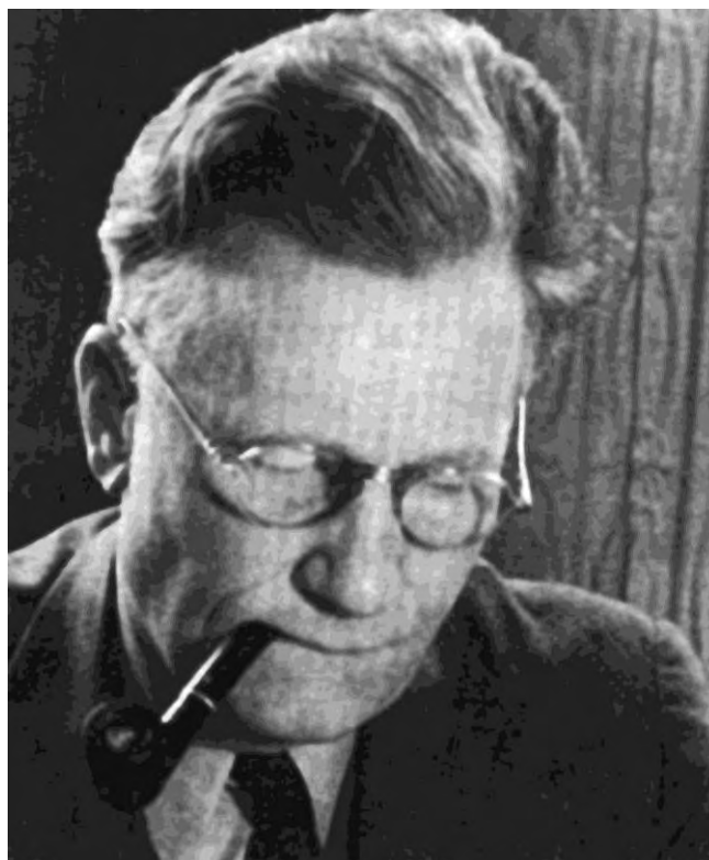
James P. Cannon, founder of American Trotskyism.

But with the impending threat of imperialist war and the drying up of the various centrist currents following the advent of the popular-front governments in France and Spain, the objective need for the foundation of a new International permitted no further delay. In September 1938 the founding conference was held outside Paris with 21 delegates representing 11 coun-