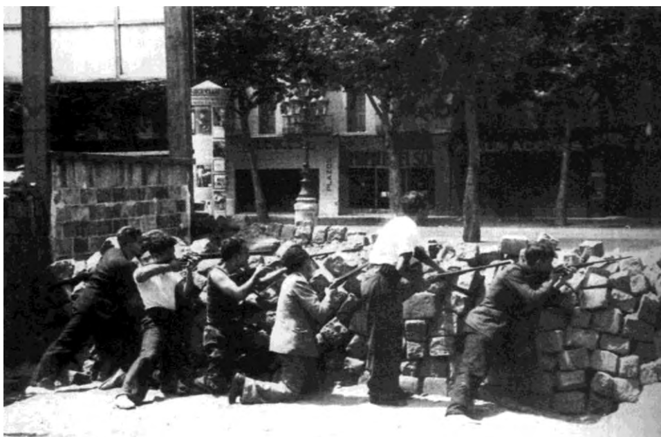
Barricades during street fighting in Barcelona May Days 1937. Popular Front government dispatched Stalinist-led assault guards (below) to crush anarchist and POUM workers. Stalin was the butcher of the Spanish Revolution.

In all this the Spanish CP had acted as the guarantor of bourgeois order, leading the offensive against