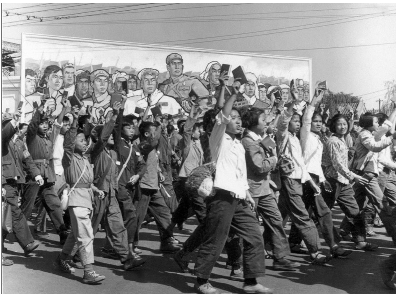
Red Guards marching in Beijing in 1966 at beginning of the “Cultural Revolution.” Student youth were used by the Mao wing of the bureaucracy as shock troops against the workers.

a step which fundamentally changed the course of the Cultural Revolution and eventually led to its liquidation. In February 1967, the army was called in to support the Red Guards in “seizing power.” Now the PLA officer corps is of the flesh-and-blood of the bureaucracy, tied to the rest of China’s officialdom by innumerable personal and social affiliations. As a condition for militarily supporting the Red Guards the PLA command demanded that there be no wholesale purge of the incumbent administrators, that they be allowed to rehabilitate themselves. This was the so-called “mild cadre policy.” The role of the PLA in preserving the bureaucracy was codified by a change in the formal program of the Cultural Revolution. When launched in 1966, the Cultural Revolution was supposed to produce a political system modeled on the Paris Commune. In early 1967, this was changed to the so-called “triple alliance” of “revolutionary rebels” (Red Guards), the PLA and the “revolutionary cadre” (incumbent bureaucrats). Clearly the officer corps was in charge.