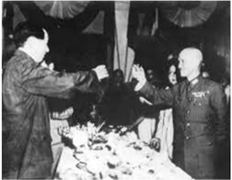
Mao Zedong’s “anti-imperialist united front”: toasting Chiang Kai-shek, the butcher of Shanghai 1927, in 1945.

Mao’s policies in this period were not always more militant than the CP leadership’s, however. In the fall of 1924, he was removed from the Politburo of the party because of too-close ties to right-wing Guomindang circles. But Mao’s most general pattern of “protest” against a policy he disagreed with was to simply go off to the hills and carry out the policies he believed correct. When a Comintern telegram on 31