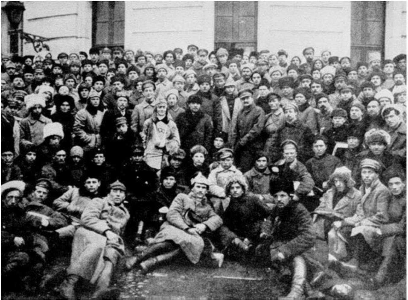
Lenin, Trotsky and Red Army troops in Petrograd in 1921.