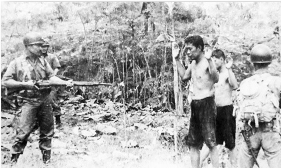
Prisoners captured during Trisula operation in Indonesia, 1965. More than 1 million were killed in anti-Communist massacre. Mao paved the way by urging Indonesian Communists to ally with nationalist president Sukarno, as CCP had done with Chiang Kai-shek in 1927, with the same deadly results.

to retaliate by cutting off all economic aid in 1960. This may be taken as the official date of the split.