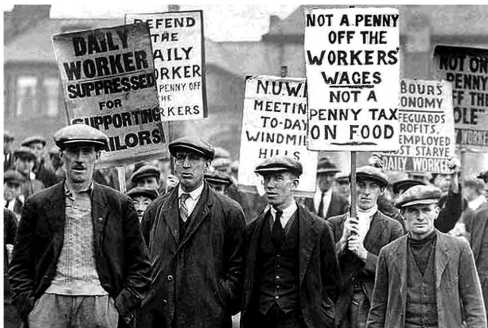
Workers demonstrating during 1926 British general strike. Stalinist bureaucracy covered betrayal by Trades Union Congress tops.

In 1925, British coal operators sought to terminate the 1924 contract and replace it with a new agreement which would reduce miners to a below-subsistence standard of living. After an official inquiry into the industry, the government returned a report which would have placed the main burden of modernizing the coal industry on the miners. Their answer was a strike beginning on 3 May 1926. The next day the whole country was in the throes of a general strike. Councils of action were set up in the workers' districts to keep up morale and control the issuing of permits for emergency