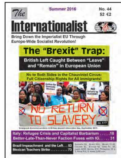
The Internationalist, magazine of the Internationalist Group/U.S.