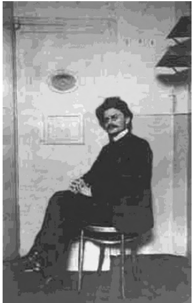
Trotsky, president of the Petrograd Soviet, awaits trial after 1905 revolution. While in jail he wrote his major theoretical work, Results and Prospects , presenting the theory of permanent revolution.

Marx did not believe that the working class could directly achieve victory in 1848, but that it would be forced to support the liberal bourgeoisie and petty bourgeoisie insofar as they fought against feudal-absolutist reaction. But even in this pre-imperialist period, when the proletariat was quite weak and politically dominated by the artisan and democratic petty-