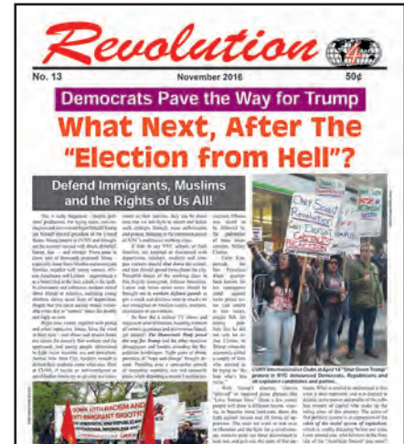
Revolution, newspaper of the CUNY Internationalist Clubs