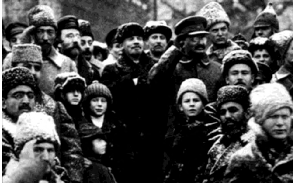
Lenin and Trotsky in Moscow’s Red Square, 1919, on the second anniversary of the October Revolution.

Thus, it is easy to “prove” that Trotskyism is reformist by citing the policies of the SWP and the WL. But this has about as much value as “proving” that Lenin was for a “peaceful road to socialism” by citing Khrushchev.