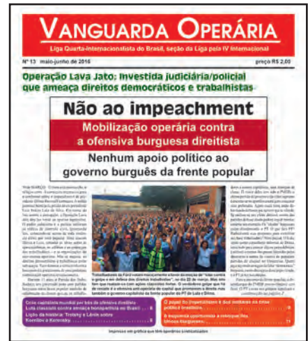
Vanguarda Operária, newspaper of the Liga Quarta-Internacionalista do Brasil