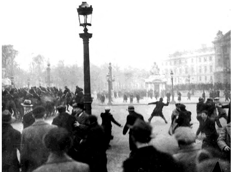
Above: mobilization of ultra-rightist squads of Action Française on 6 February 1934 sought to topple bourgeois Radical government. Below: On 12 February 1934, over 100,000 workers took to the streets against the fascistic and monarchist mobs. But instead of forming a workers united front, as Trotsky called for, the CP and SFIO formed a popular front with the bourgeois Radicals.

In July 1935 the French Stalinists expanded the coalition to include the bourgeois Radical Socialists. The Radical Socialists, based on the urban and rural petty bourgeoisie, advocated progressive social changes but were firmly committed to private enterprise and