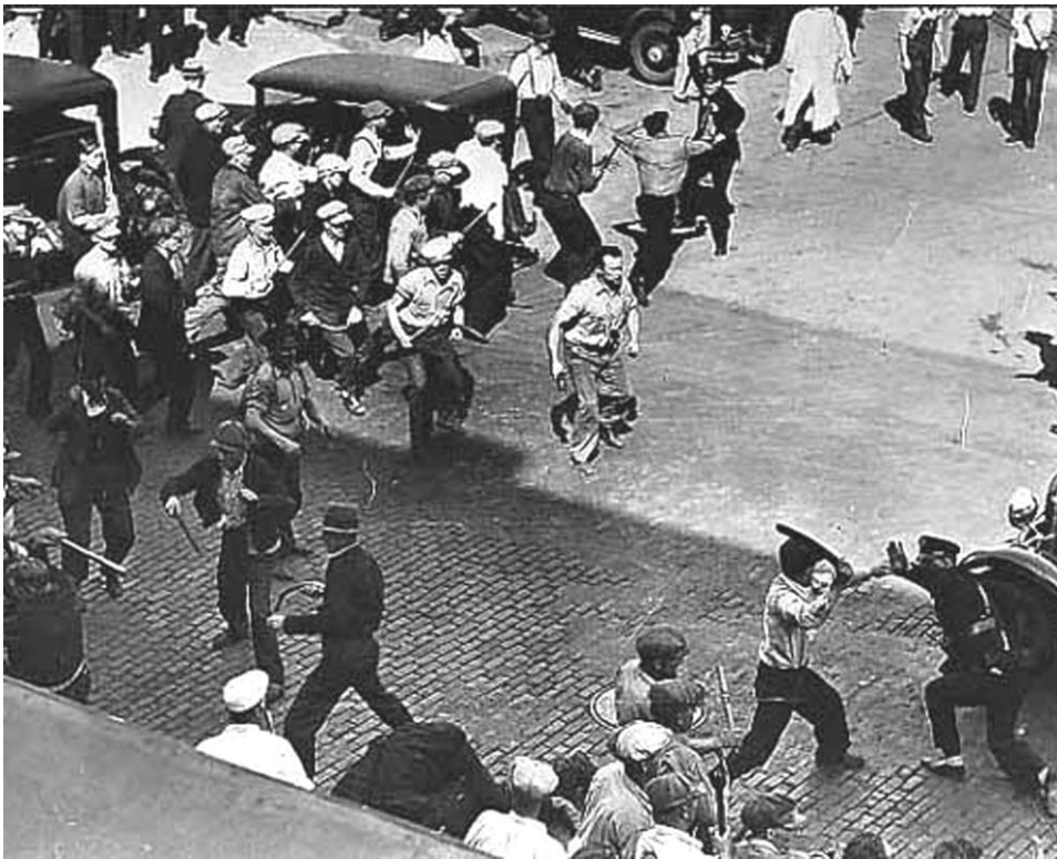
The “Battle of Deputies Run” during the 1934 Minneapolis Teamster strike led by the Trotskyists. When it championed the program of revolutionary Trotskyism, the Spartacist League called for building caucuses in the unions based on the Transitional Program. The latter-day and now born-again SL long ago abandoned class-struggle unionism, which is continued today by the Internationalist Group and League for the Fourth International.

tarian class struggle. Thus after criticizing the SWP for tailing petty-bourgeois feminists, Davidson counterposes the “mass democratic struggle for the emancipation of women.” This is the tip of the iceberg, for behind the contention that the struggle for women’s liberation is only “democratic” (and not socialist) lies a call for maintenance of the bourgeois family (simply “reforming” it by calling “for husbands to share equally in the responsibilities of the home”) and for an alliance with “even the women of the exploiting classes.”