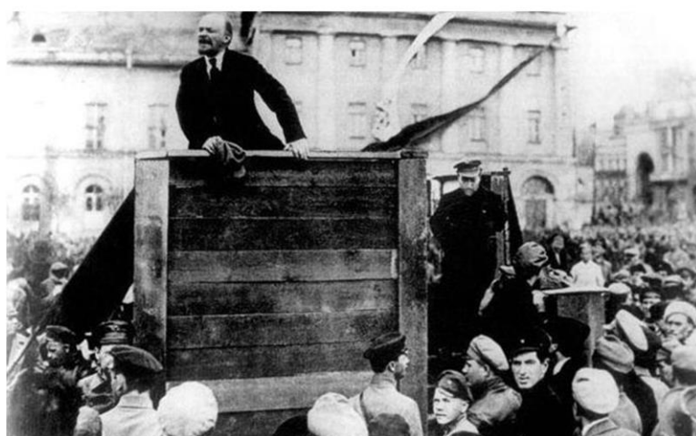
Stalinist doctoring of history: Top photo shows Lenin speaking in Moscow’s Red Square on May Day 1920 while Trotsky and Lev Kamenev await their turn. Lower picture was retouched to “disappear” Trotsky and Kamenev.

rural proletariat that the struggle against the bourgeoisie, and therefore against the well-to-do peasants too, can be properly waged.”