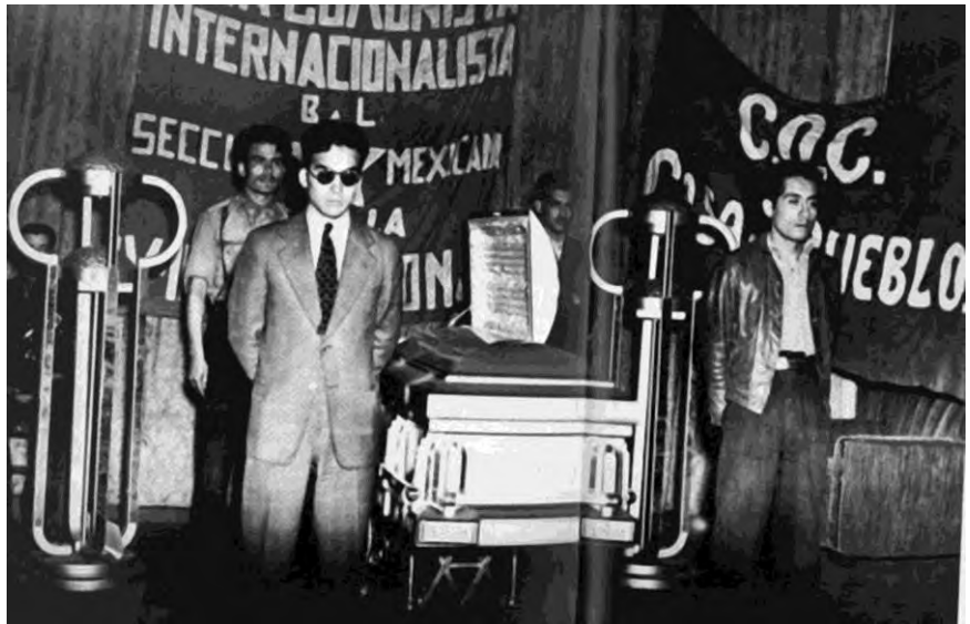
Honor guard of Mexican Trotskyists after Leon Trotsky's murder by a Stalinist assassin on 20 August 1930. Reforge the Fourth International as the world party of socialist revolution!

We must learn from this history of defeats that revisionism leads to the same consequences whether it comes from Stalinist origins or from erstwhile Trotskyists. The Maoist line defended by the Guardian in no way offers a proletarian alternative to the reformism of the SWP. Instead of the SWP's single-issue reformist campaigns in alliance with the liberal bourgeoisie (NPAC [National Peace Action Coalition], WONAAC [Women's National Abortion Action Coalition]), the Maoists propose multi-issue reformist campaigns in alliance with the liberal bourgeoisie (PCPJ [People's Coalition to Peace and Justice]). The only road to socialist revolution is to make a sharp break with Stalinist and Pabloist revisionism and return to the Marxist program of proletarian class inde-