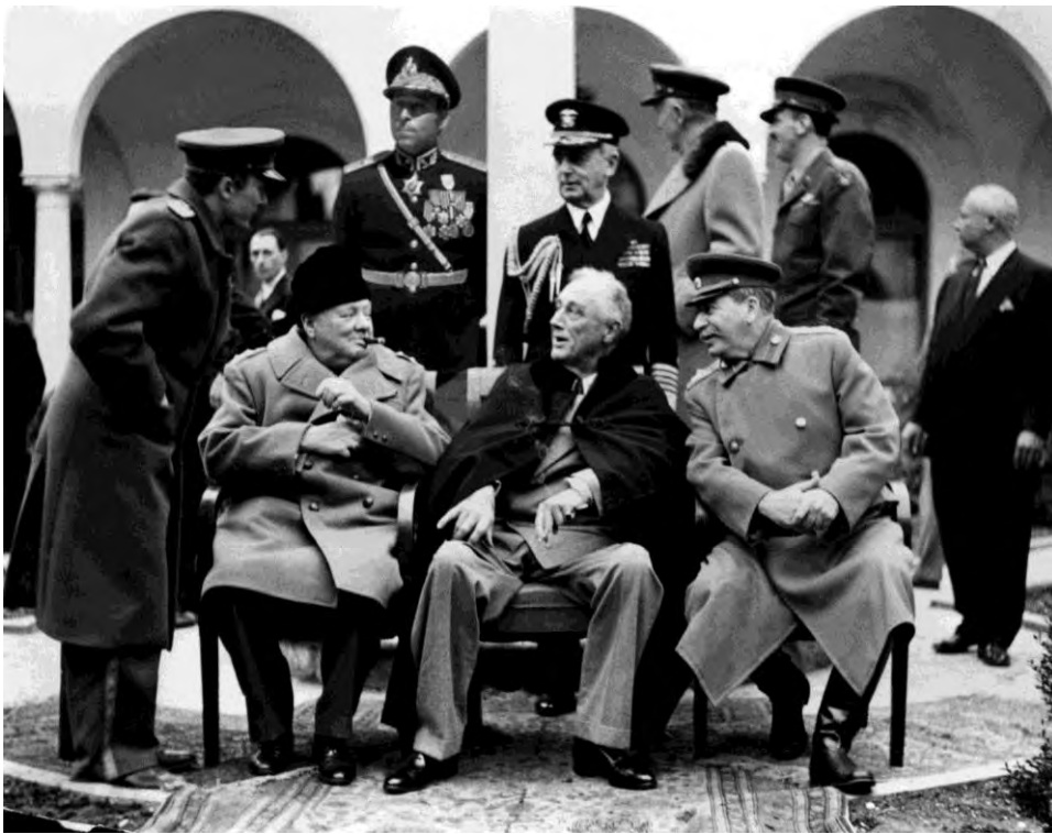
Churchill, Roosevelt and Stalin meet at Yalta in 1945. Stalin dissolved the Communist International in order to support the war effort of the “democratic” imperialists. Stalinists in imperialist countries enforced strike bans.