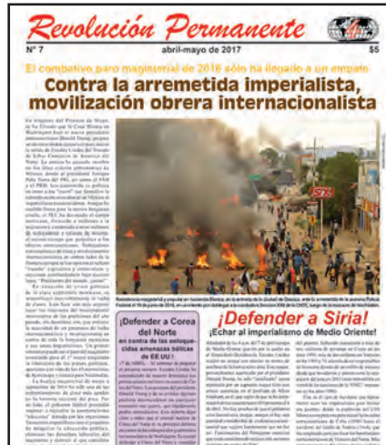
Revolución Permanente, newspaper of the Grupo Internacionalesita/México