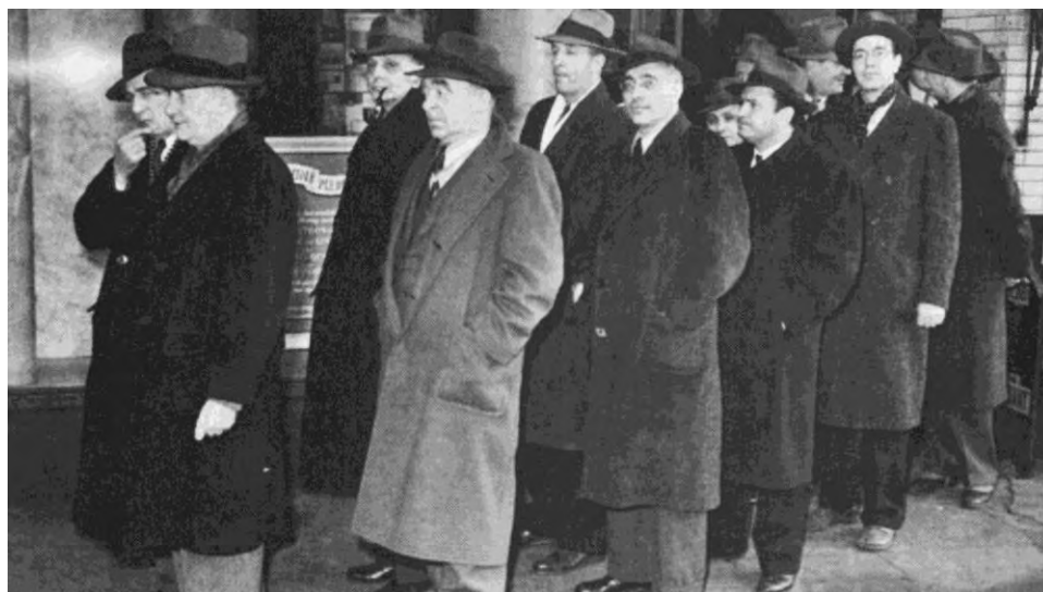
Some of the 18 Trotskyists and Minneapolis Teamsters imprisoned in 1941 for their courageous internationalist opposition to the imperialist Second World War, even as they defended the Soviet Union.

But defense of the Soviet state required above all the ousting of the Stalinist regime which consistently sabotaged that defense. By the theory of “socialism in one