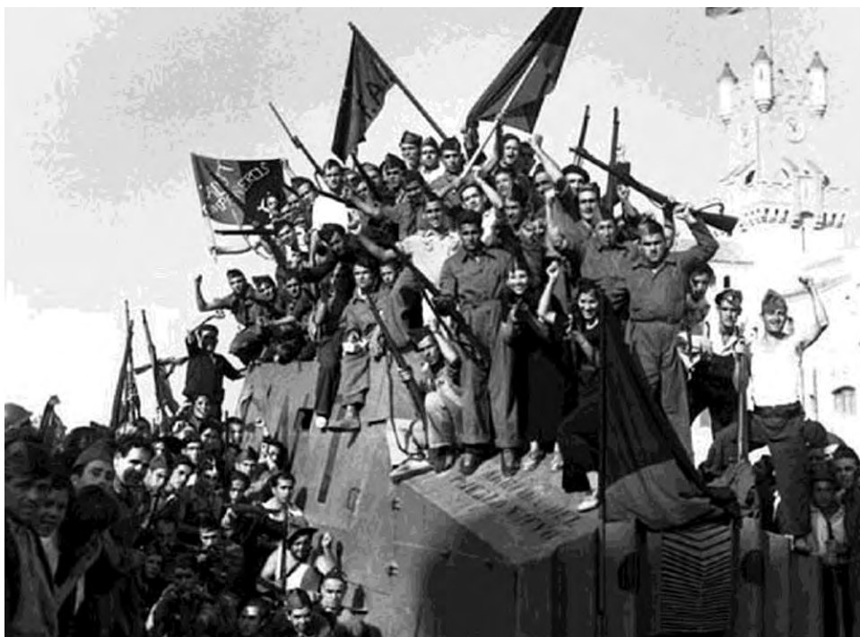
Anarchist-led anti-fascist workers militia in Valencia, Spain during Civil War. Anarchist CNT leaders joined with Stalinists, Socialists and bourgeois politicians in popular-front government that repressed the workers and murdered leftists, sealing the fate of the Spanish Revolution.

This temporizing might have succeeded if the masses of workers had not taken matters into their own hands. In Barcelona, a stronghold of the anarchists and the POUM, workers took over numerous factories and stormed the army barracks with pistols. In less than a day they had complete control of the city. This sparked similar revolts elsewhere, and the republican govern-