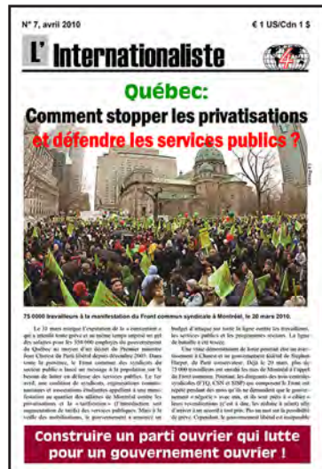
L'Internationale, organ of the League for the Fourth International