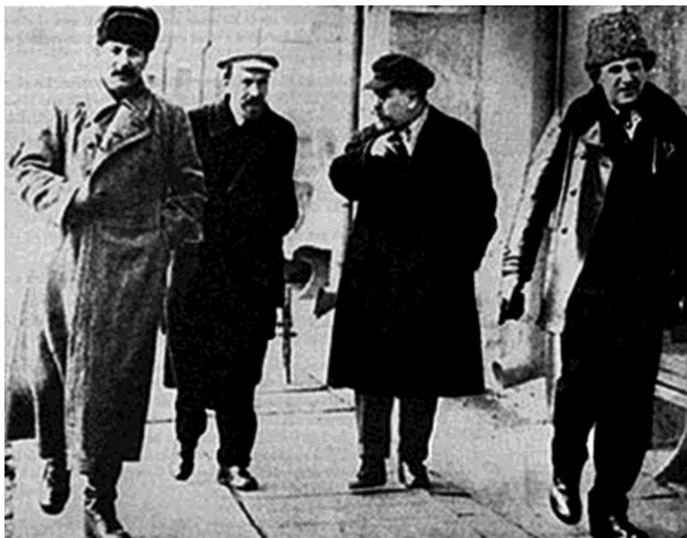
The triumvirate seized power upon Lenin's death. From left: Stalin, Rykov, Kamenev and Zinoviev.

A sharp crisis in the party broke out in the winter of 1923-24 over the combined issues of party democracy and industrialization. The "New Economic Policy" of cooperation with the peasantry had led to the emergence of a strong kulak (rich peasant) element in the countryside, which was increasingly conscious of its bourgeois interests in opposition to the Soviet government, while industry continued to grow at a "snail's pace"; at the same time Stalin was running the party as a private fiefdom through the system of appointed secretaries. Trotsky demanded a sharp turn toward centralized planning and industrialization, an offensive against the kulaks and the return of democratic norms within the Party. The Triumvirate opposed this. (A year later Bukharin, who supported Stalin's policies, made his famous speech about "building socialism at a snail's pace" and calling on peasants to "enrich yourselves"!) What is more, they moved to make sure their line would prevail at all costs: during February-March 1924, no less than 240,000 raw recruits were brought into the party in the "Lenin levy," and as soon as they were enrolled they were lined up as voting cattle to back the line of the General Secretary (Stalin). By this and various other bureaucratic maneuvers he was able to eliminate almost all oppositionists from the May 1924 Party conference, which was turned into an anti-Trotsky rally.