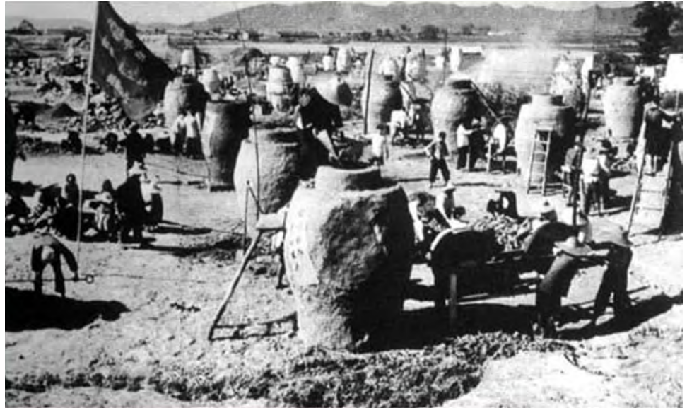
Primitive backyard furnaces during Mao's "Great Leap Forward" turned out to be disastrous, producing steel unfit for industrial use.

The Cultural Revolution was directly related to the failure of the Great Leap Forward (1958-60) and its impact on Mao's standing in the party. The Great Leap Forward, in turn, arose from the impossibility of imposing orthodox Stalinist industrialization policies dur-