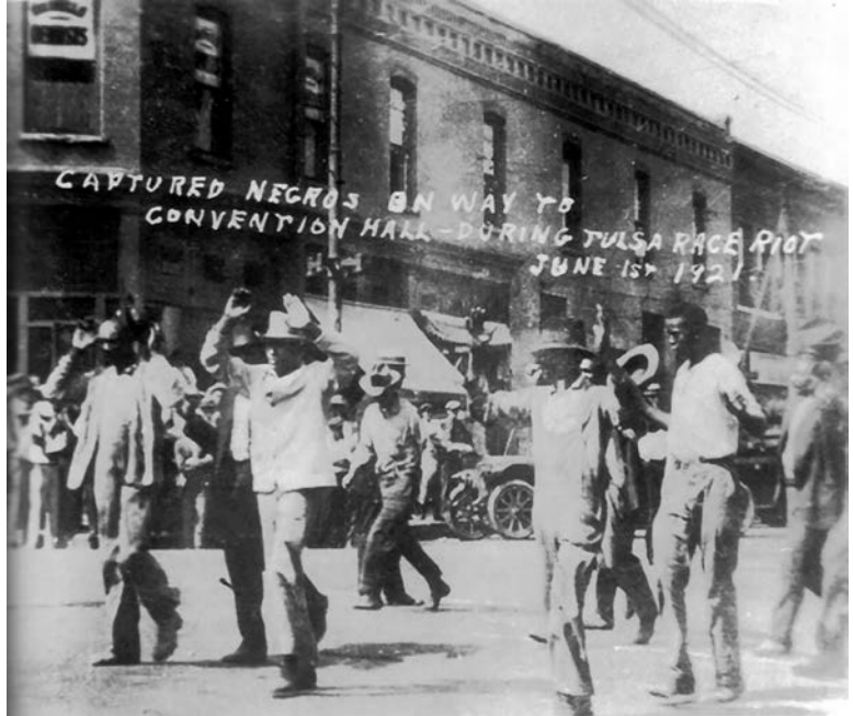
Tulsa, Oklahoma, 1 June 1921: Hundreds of black men were seized at gun point and marched to detention centers while vigilantes burned down the black community of Greenwood.

As African Americans were driven into blighted areas of industrial cities by conscious policies of housing and employment discrimination, the capitalist state’s coercive machinery