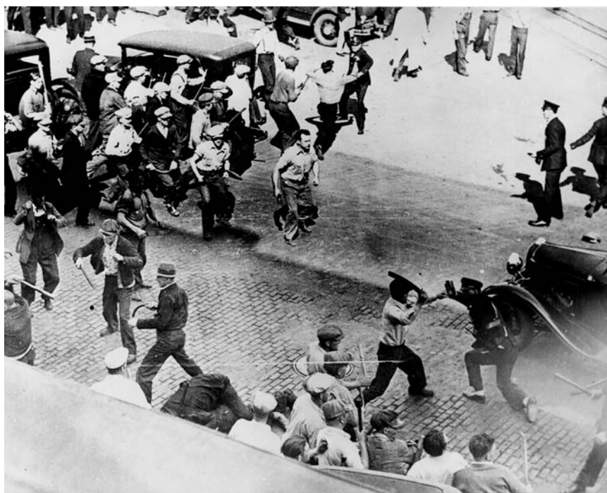
"Battle of Deputies Run," 21 May 1934. Hundreds of striking Teamsters ran off 1,500 police, special deputies and scabs.

"Driving while black," "jogging while black," "sleeping at home while black." Floyd is just the latest addition to the