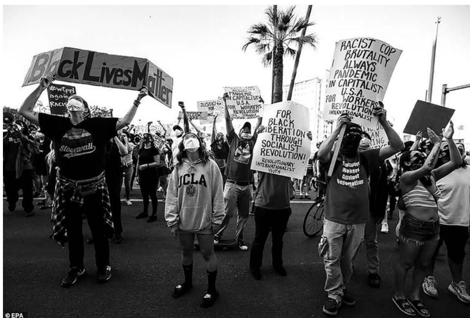
Internationalists at May 27 Los Angeles protest over murder of Floyd George by Minneapolis police.

pain' bromides, the liberals call in the cops."