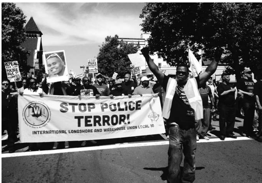
International Longshore and Warehouse Union Local 10 shut down San Francisco Bay Area docks on May Day 2015 denouncing police terror.

Struggle Workers – Portland, Oregon organized a multi-union contingent in the May Day 2015 protests marching under the banner, “Labor Against Racist Police Murder.” (The CSWP is a tendency in Portland-area unions that is politically supported by the Internationalist Group.) These are small examples of what needs to be done, but they point in the right direction. The idea that justice could be obtained by pressuring the courts and capitalist politicians to investigate, “reform” or prosecute the racist police on which capital depends is a dangerous illusion. We must look to using our own class power to put an end to the bloody lynch law system that has taken so many of our brothers and sisters from us.