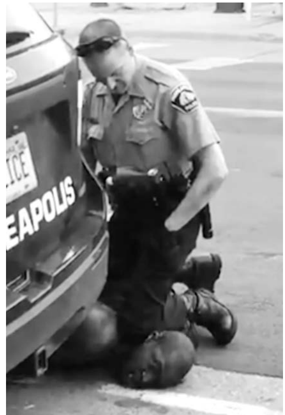
Minneapolis cop knees George Floyd, killing him, 25 May 2020.