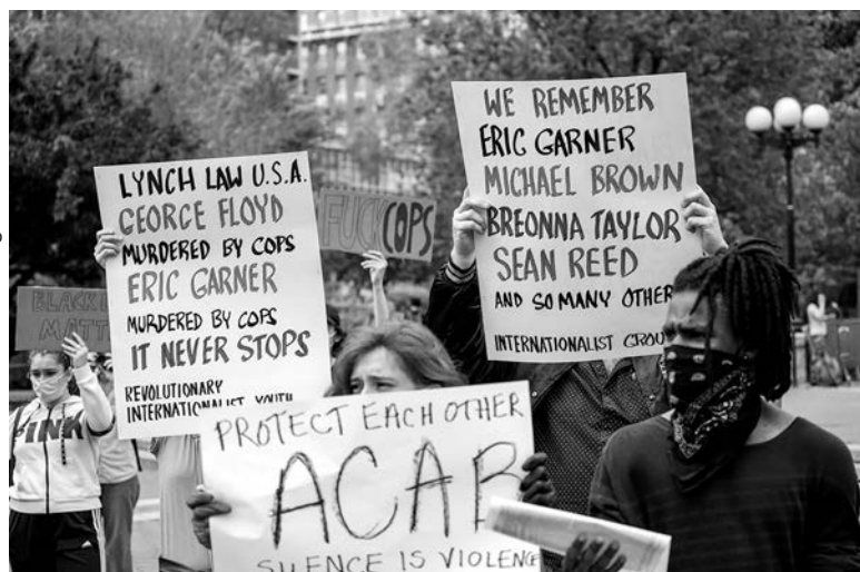
NYC protest, May 28, against cop murder of George Floyd.

endless list of African Americans and Latinos murdered by the police, in a country where racist repression is and always has been the linchpin of capitalist exploitation. This goes back to slavery days, when runaway slaves would be hunted down by squads of slave catchers. These patrols paved the way for modern-day police departments. In recent decades, the police and courts have ramped up mass incarceration, particularly of black men, while cops across the U.S. kill an average of over 1,500 civilians a year, with black men five times as likely to be gunned down by police as white men (see “Black America Under the Gun: Workers Revolution Will Avenge Philando Castile,” The Internationalist No. 48, May-June 2017).