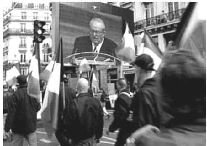
Nothing “ex-” about these fascists. Skinheads march before screen showing National Front Führer Le Pen at 1 May 2002 FN mobilization in Paris.

Now the battle is on for the legislative elections, June 9. Even though Chirac got barely one-fifth of the votes on April 21, this won’t stop him from striking a pose as “savior of the nation,” affecting a cheap imitation of his former patron, General Charles De Gaulle, the bonapartist strongman who erected the presidential Fifth Republic. Le Pen’s National Front is expanding even as new witnesses come forward accusing him of