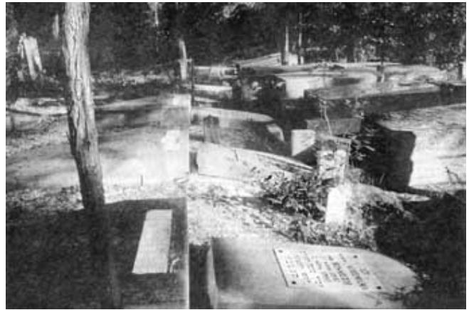
National Front merely an "electoral party"? Jewish cemetery at Carpentas, France where in May 1990 fascists dug up body and impaled it, destroying 39 gravestones. Members of the Nazi PNFE were tried for the desecration. The head of the PFNE was a municipal councillor elected on the FN ticket.