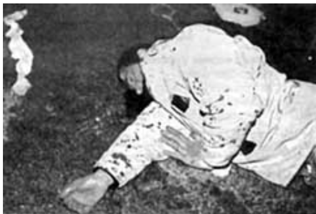
French unions don't face “organized fascist gangs attacking workers’ picket lines”? False. Left: striking drivers in Vitrolles, near Marseille, were assaulted by squad of National Front thugs during national truckers strike, 5 November 1997.

European capitalists look with envy at the destruction of the British unions that began with Margaret Thatcher’s breaking of the 1985-86 coal strike. As French bosses close one plant after another, French unionists are constantly facing gangs of professional strikebreakers linked to the FN/DPS and other fascist outfits. Among these “security companies” are the AGS, Embassy, Bègue Consultants, Éric SA, Groupe Onze International, Groupe Onze France, Normandy, OGS and SPGM. They supply the same thugs who beat up leftists and immigrants outside National Front